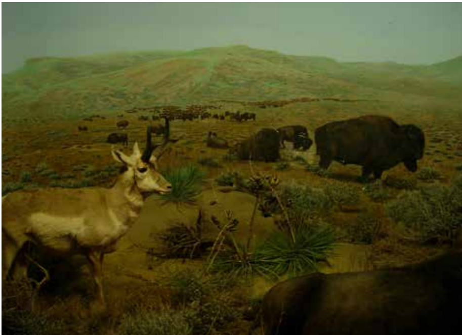
Habitat/dioramas showing original backgrounds, c. 1970.

In 1951, taxidermy specimen displays expanded into the basement of Corinthian Hall, along with mineralogical exhibits of fossils, rocks, and minerals. A new board trustee, Arthur Popham, Jr., took an active role in developing improved displays of mounted animals, placing specimens in naturalistic settings. Mr. Popham and many others believed that dynamic taxidermy displays filled with mounted specimens procured in the wild would contribute to an understanding of natural systems and encourage conservation of species and habitats. Such dioramas created lifelike exhibits but were increasingly inconsistent with the Beaux-Arts decorative interior of Corinthian Hall.