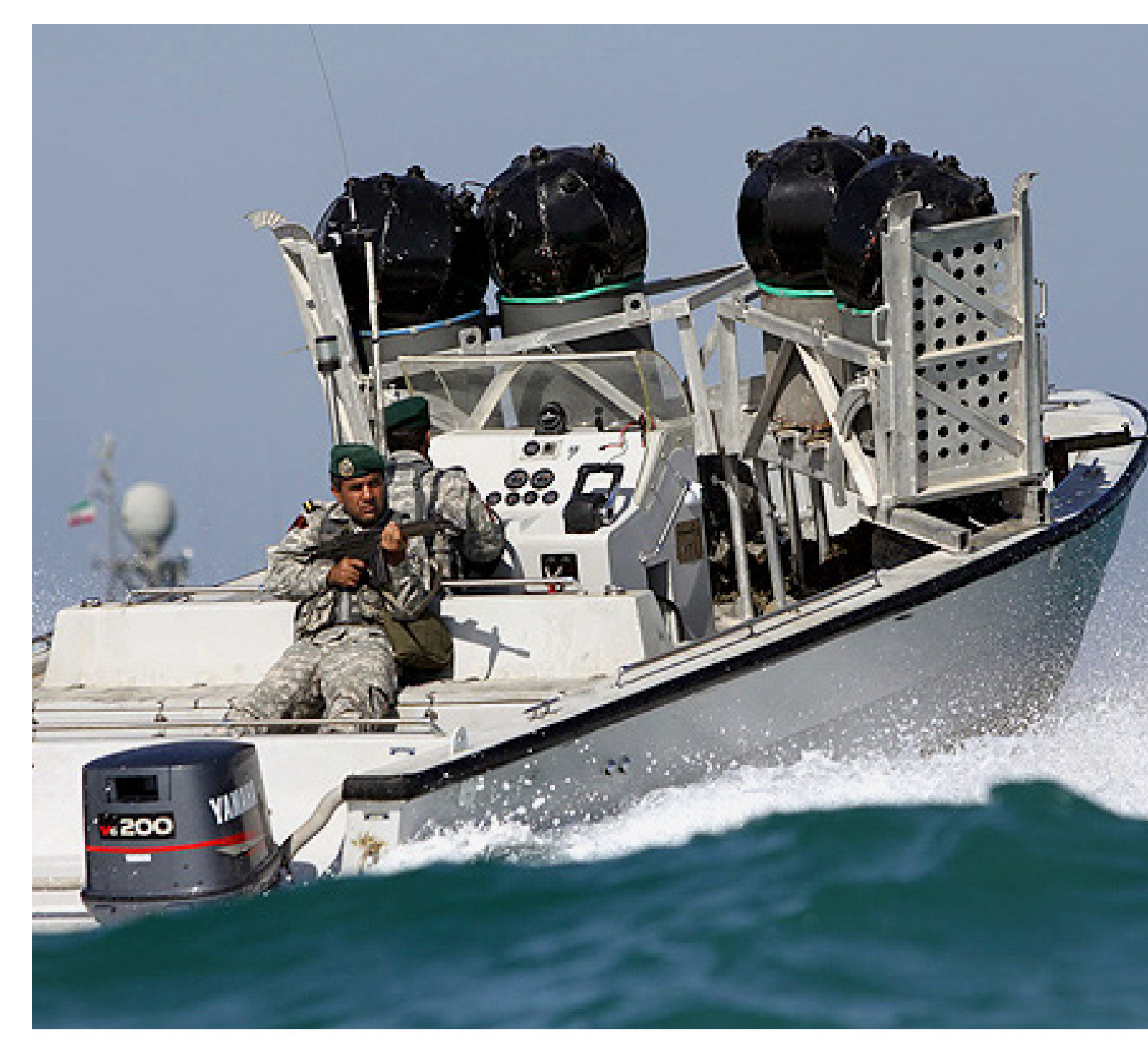
Photo above: Both the Iranian national and revolutionary navies regularly practice mining the Gulf waters. Here an IRIN speedboat is rigged to rapidly dispense four floating mines, two from each side. IRGCN boats usually carry two mines.

"The simplest and most effective way to block shipping lanes and waterways with disproportionate deterrent and psychological effects is to lay (or even to threaten to lay) sea mines."