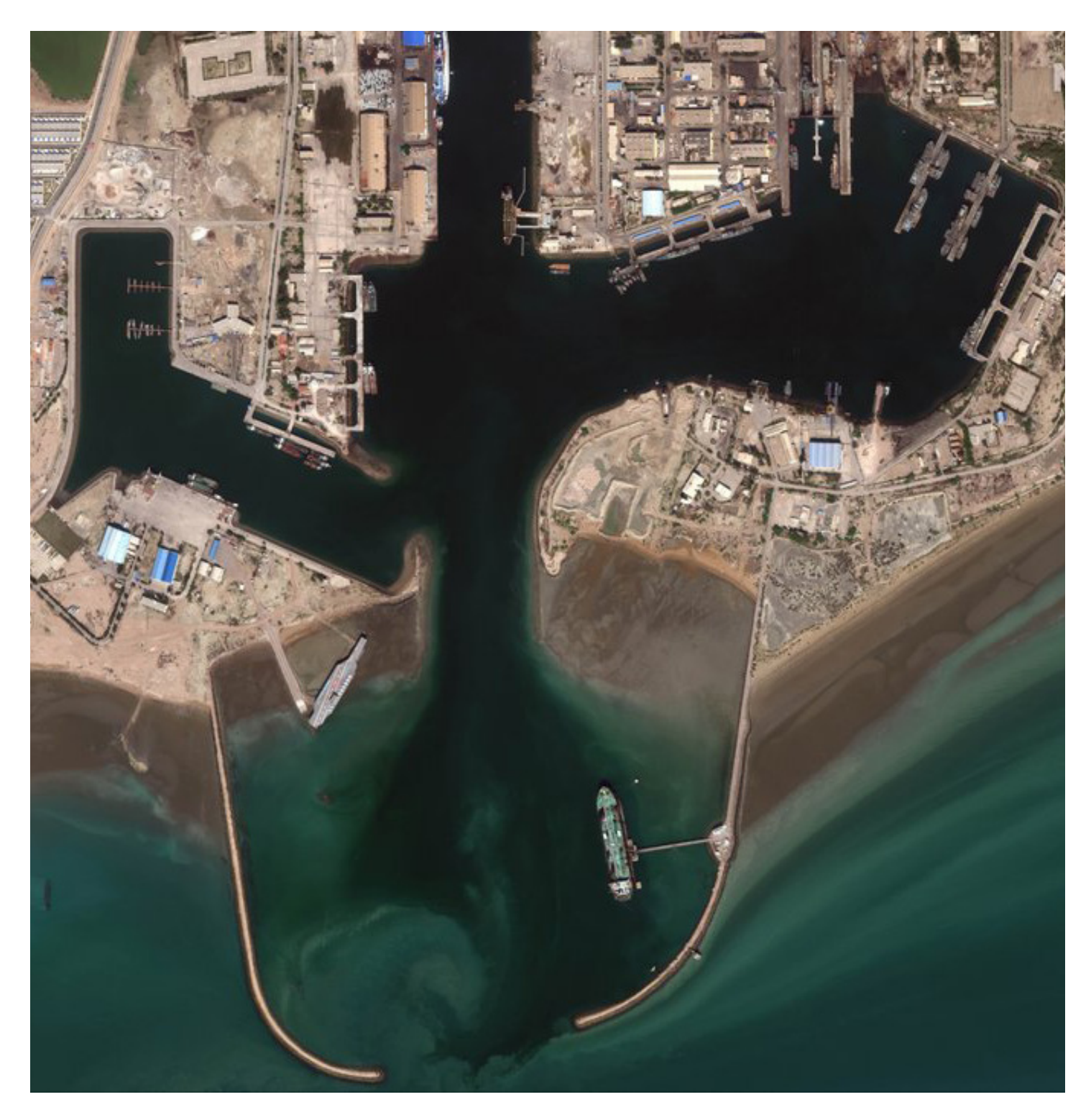
Photo above: A general overhead view of Iranian naval headquarters in Bandar Abbas. To the left of the harbor entrance channel is the IRGCN section and to the right is the IRIN's First Naval Base. Moored to the left breakwater is a mockup of the USS Nimitz, which capsized and sank in August 2020 after a live fire exercise, and to its right is IRIN's former flagship IRINS Kharg, which caught fire and sank on the approach to Bandar Abbas in June 2021.