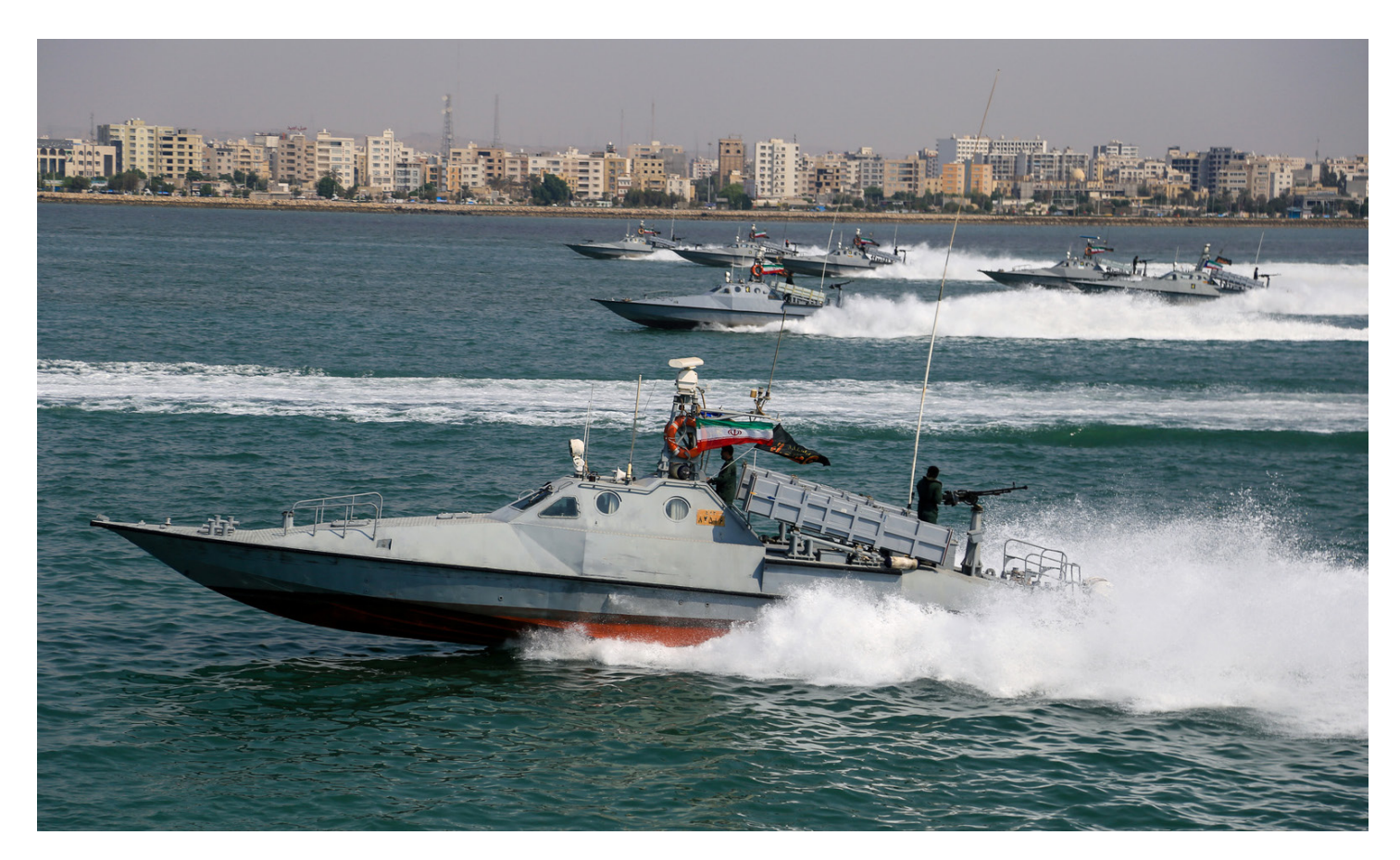
Photo above: The IRGCN uses a mixture of well-armed, high-end fast missile boats such as Zolfaghars (pictured here) armed with two Zafar/ Kowsar anti-ship missiles with a range of 25 km, and lightly armed lower-end Ashura boats (not pictured here) armed with a 12.7-mm machine gun and a 107-mm rocket launcher or two floating mines.