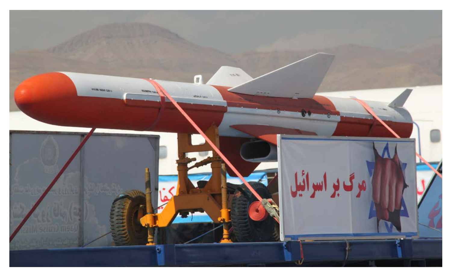
Photo above: Iranian defense industries have produced a range of anti-ship cruise missiles based on Chinese models, including this air-launched version of the C-802 Noor missile with a range of between 75 and 120 kilometers.

received the same order from Khamenei, the IRIN, however, dragged its feet for an additional decade.<sup>25</sup>