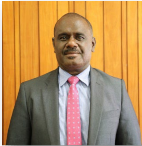
Hon. Jeremiah Manele Minister of Foreign Affairs and External Trade Solomon Islands

Honourable Mr. Jeremiah Manele is the Minister for Foreign Affairs and External Trade of the Solomon Islands. He possesses vast civil service experience having held senior Government positions and represented Solomon Islands as a career diplomat.