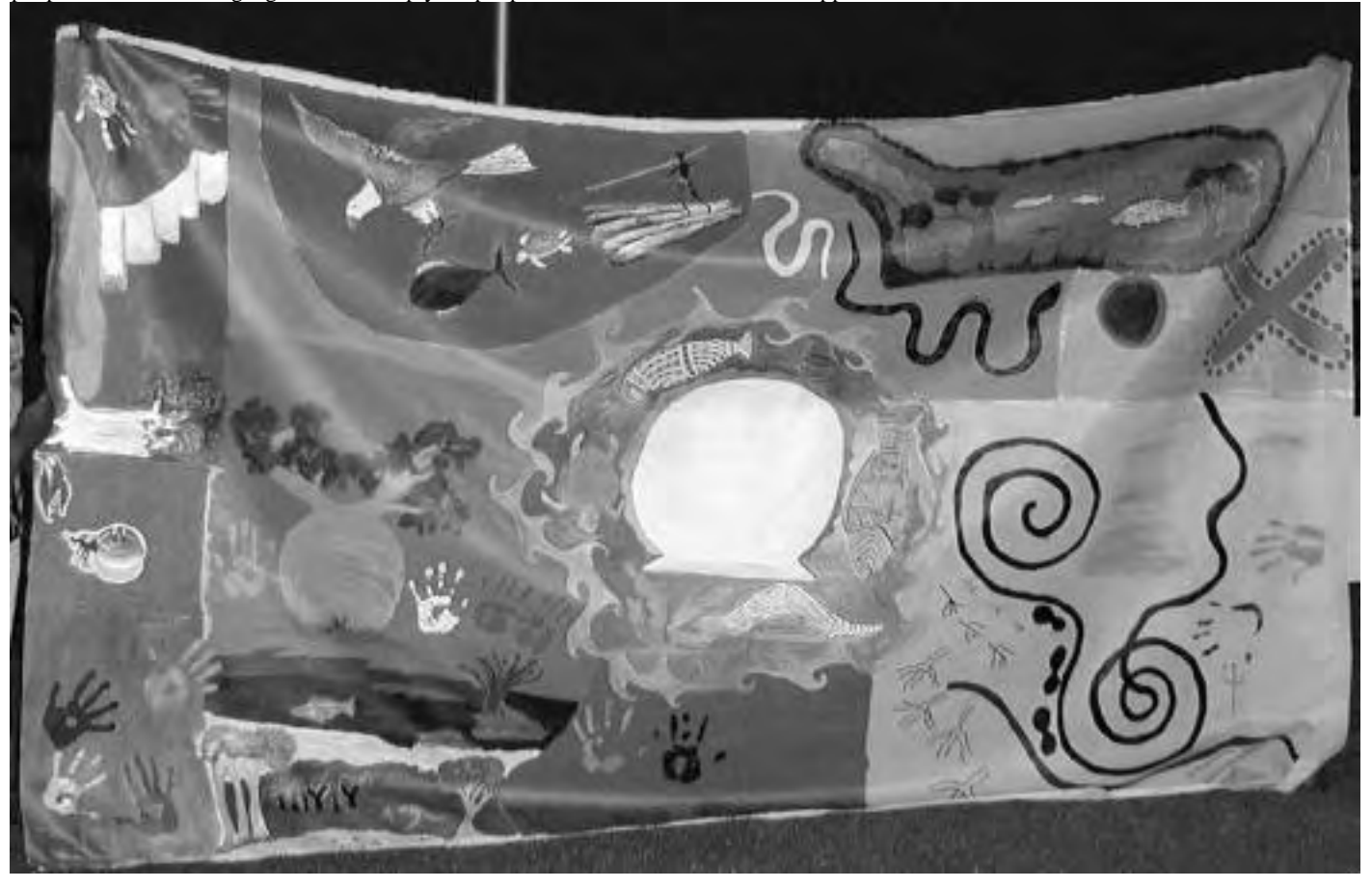
Picture painted for FEL by the many Aboriginal people at FEL VII; each section was painted by a different language group.

FEL too would like to thank Argyle Mining for their generous support. Nigel Crawhall, of the South African San Institute, proved an indispensable asset to our conference.