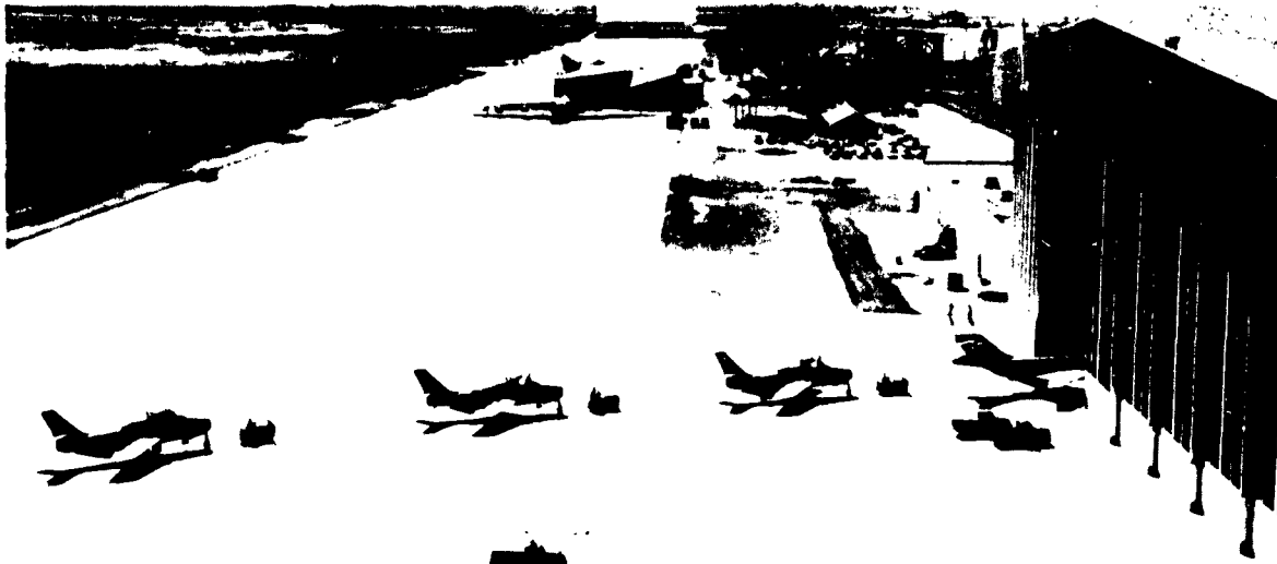
The flight line in 1955 was a beehive of activity as hangars were moved from the old South Base to the new Main Base area. One of the hangars became the maintenance hangar for school aircraft.