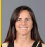
Brandi Chastain #6 Midfield/Fwd