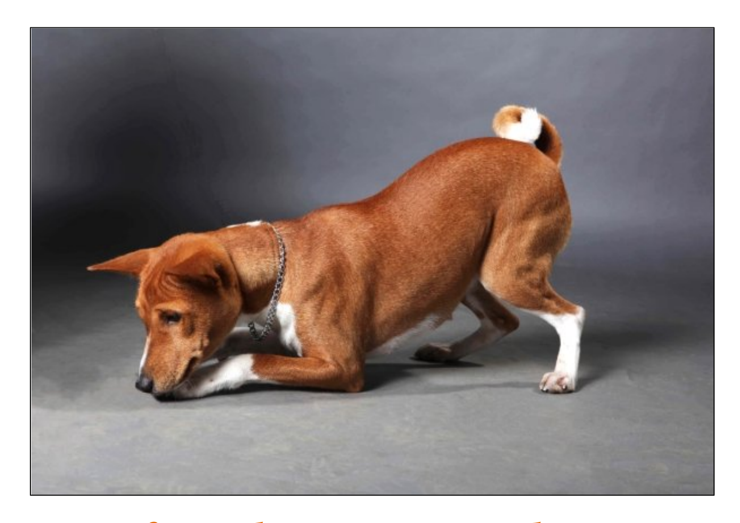
If you have answered yes to the above questions then a Basenji may be the right dog for you!