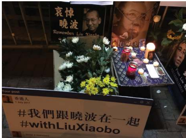
A vigil for Liu Xiaobo in Hong Kong, after his death is announced, includes a printed-out Facebook message of support. Both the medium (Facebook) and the message (Liu Xiaobo) would have been cause for censorship within mainland China.

for comedic effect, has traditionally been a large part of Chinese linguistic culture, and now serves as a popular censorship circumvention technique. Some workarounds are quite easy to comprehend. For example, to refer to the Tiananmen massacre on June 4, 1989, social media users used to type in the words, “willow, silk” which sound like “six” and “four” in Mandarin—before censors caught on and blocked instances of the word combination “willow, silk.” Other homophones are more obscure, such as the use of the word “river crab” (hexie) to poke fun at the Chinese Communist Party’s obsession with social “harmony” (hexie) and its use of the sanitized term “harmonize” to refer to censorship and political persecution. Common and less creative examples of wordplay include referring to famous activists only with their surnames, such as “Mr. Liu” for Liu Xiaobo.