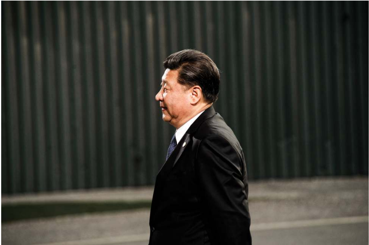
President Xi Jinping has overseen the centralization of internet control in China.

access in China, with some of the country's most successful social media companies forming in the late 90s to early 2000s. 106 Since then, although they have allowed social media in China to grow into the most widely available civil space for the exchange of opinions and information in Chinese history, 107 authorities have been careful not to allow unfettered discussions of democracy to flourish online. 108