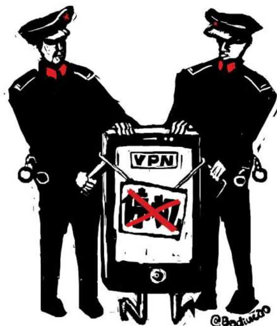
Chinese cartoonist Badiucio depicts the VPN crackdown.

Another set of recent regulatory changes are aimed squarely at limiting citizens' access to Virtual Private Networks. Virtual Private Networks, or VPNs,