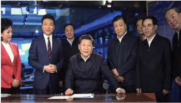
President Xi poses with media figures during a February 2016 tour of national media headquarters.