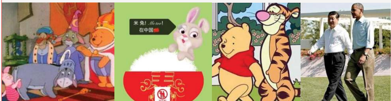
From left to right: A picture of “King Winnie”, which made the internet rounds after the news that the government aimed to abolish Presidential term limits; an image from Weibo of “mi tu”, the “rice bunny”; a popular Winnie the Pooh/Xi Jinping meme, captured via Weibo screenshot

维尼熊: 327 The words Weini Xiong (Winnie the Pooh), as well as images of the cartoon character were blocked on Chinese social media websites in 2017. Since 2013, Chinese internet users have been joking about how the bear's profile with his round belly resembled the physique of President Xi Jinping. It is not clear what spurred authorities to finally crack down on the numerous Pooh and Xi comparisons, but Winnie the Pooh memes are now increasingly censored. After the February 2018 announcement that the government was considering lifting term limit restrictions, some netizens responded with pictures of “King Winnie.” 328