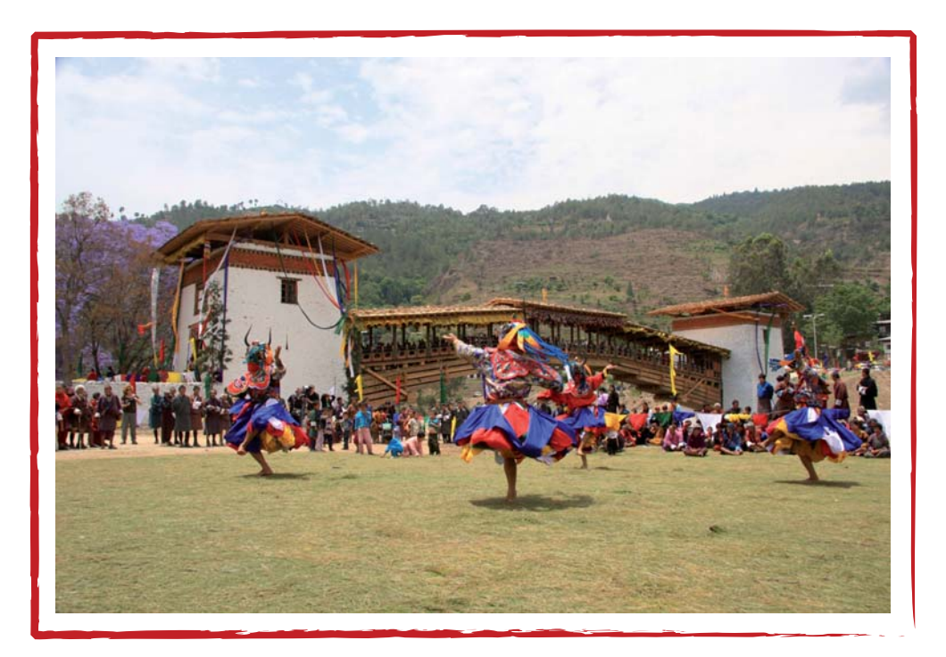
Mask dancers at inauguration 10th May 2008

The new Cantilever Bridge of Punakha in the Kingdom of Bhutan the unique project of "Pro Bhutan, Germany" to marry medieval Bhutanese bridge architecture with modern technology