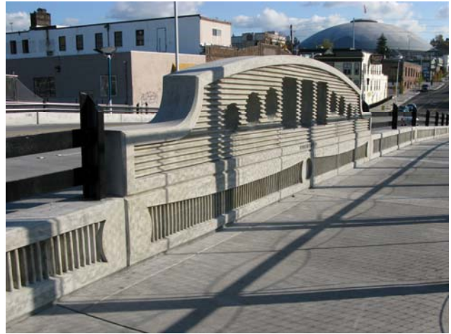
D Street overpass walls and lights (photos by Vicki Scuri)