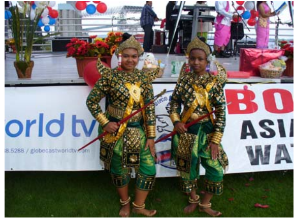
Roosevelt Dancers

Arts Projects is an annual funding program that supports a diversity of grassroots projects throughout the City. Some programs reach large amounts of people due to their public nature or longevity in the public realm, other projects provide much needed programming in specific media or underserved populations.