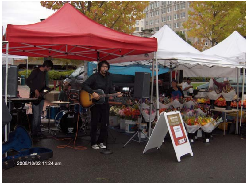
Clockwise from upper left: Jewelry making class at Tacoma Art Place, Northwest Repertory Singers in concert, Wayzgoose book arts event at King's Books, musical performance at Tacoma Farmers Market, performance by Shakespeare in the Parking Lot Company, cultural dance performance at Asia Pacific New Year Celebration.