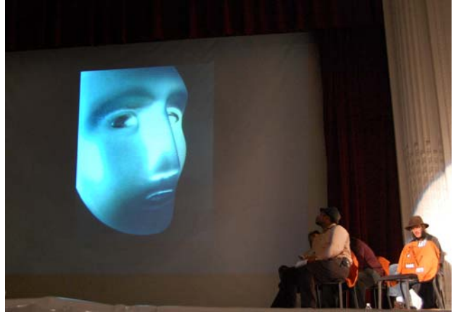
Spoken word artists and slide show at Art Slam