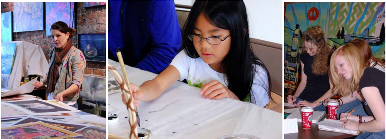
Studio Tour attendees