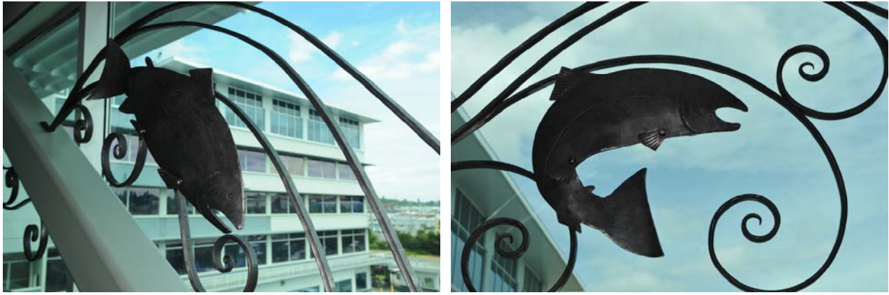
Power to Succeed, forged steel artwork on TPU skybridge