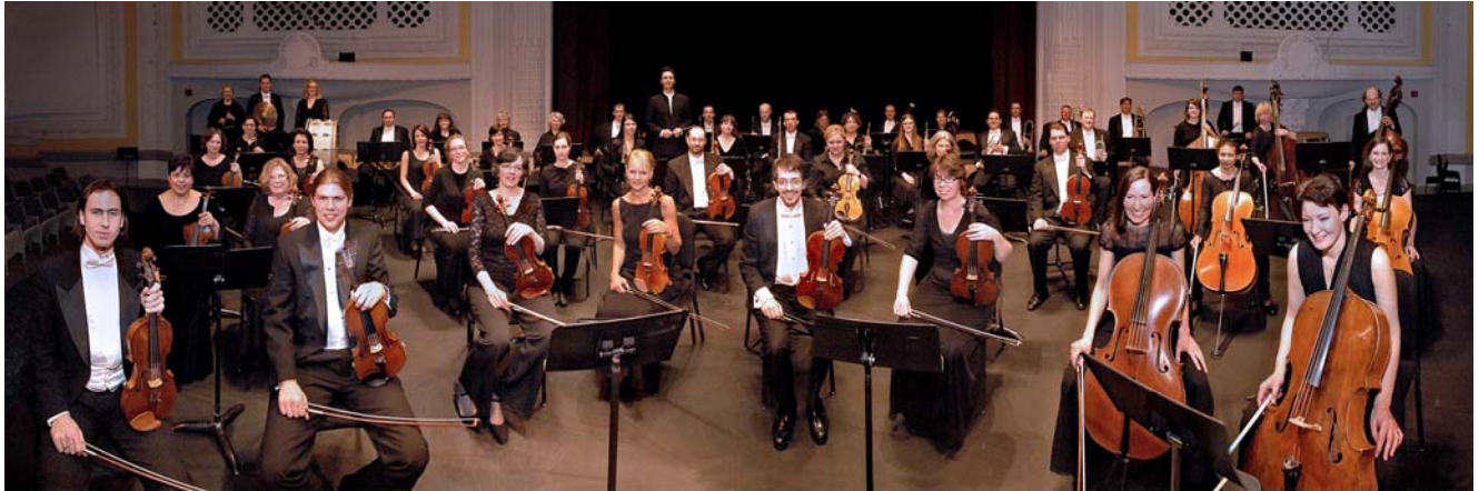
Northwest Sinfonietta orchestra

This biennial program supports Tacoma’s larger arts institutions who ‘anchor’ the cultural community through exhibited stability and excellence. In addition to serving our local population, these organizations bring in 41% of their audience from outside Pierce County bringing new dollars into our city.