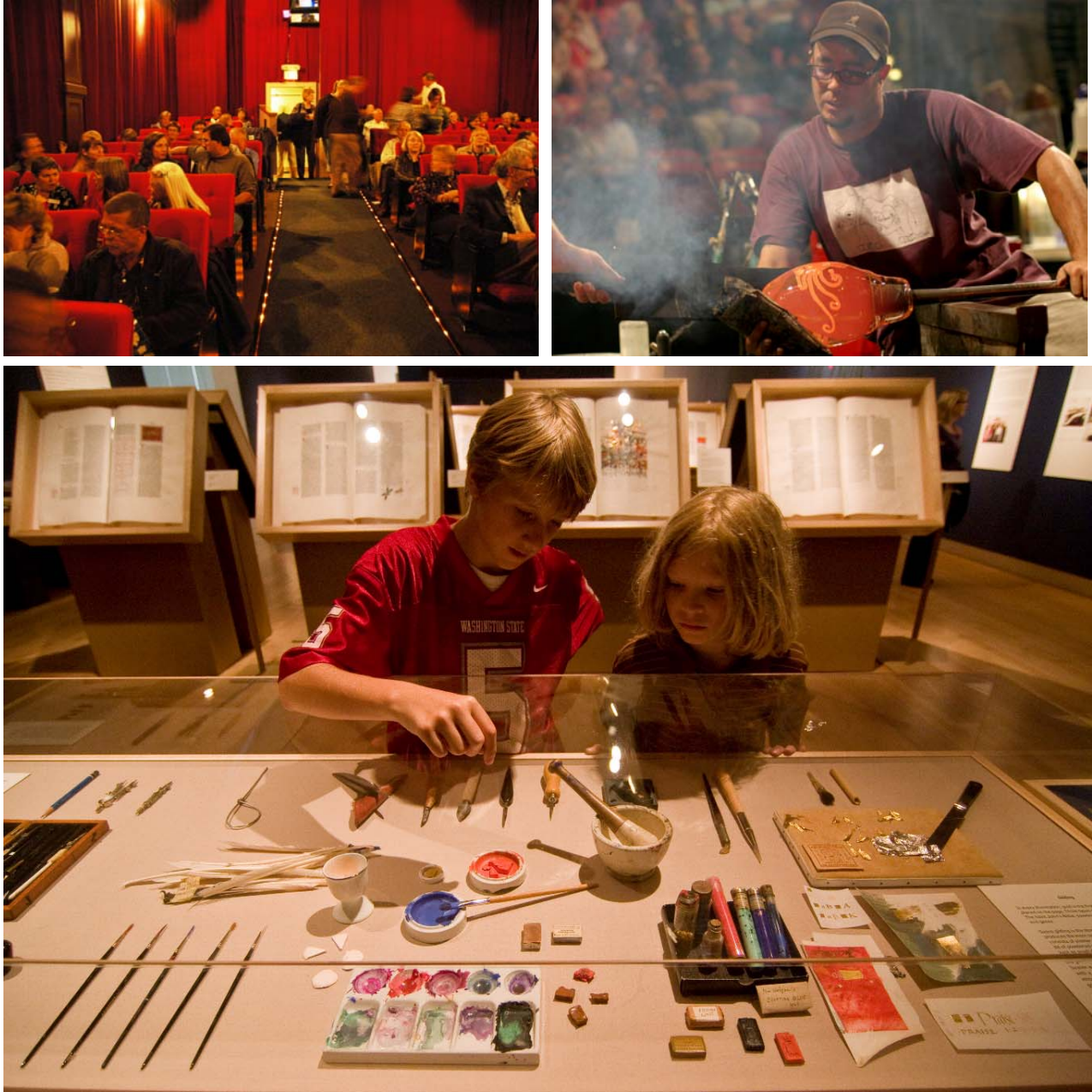
Clockwise from upper left: The Grand Cinema, glass blowing at the Museum of Glass hot shop, Illuminating the Word exhibit at the Tacoma Art Museum.