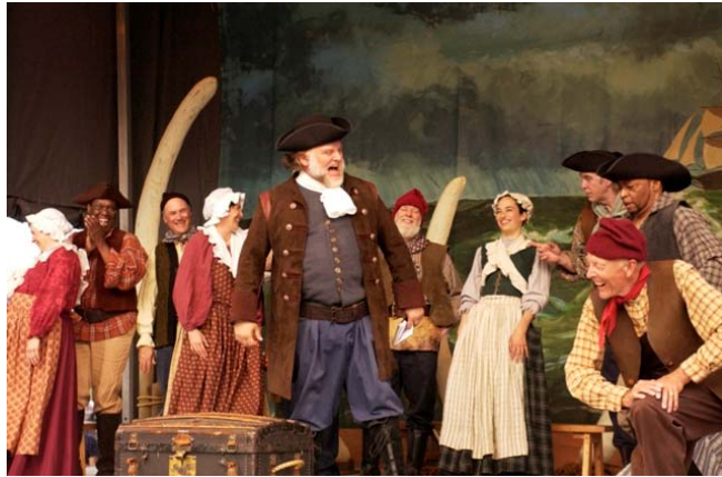
Puget Sound Revels performance