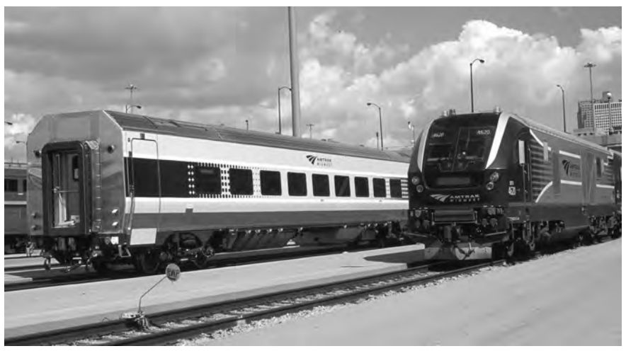
New rolling stock for passenger rail use in Illinois and other Midwest states.

The Office of Highways Project Implementation ensures that highway and bridge improvement projects are constructed and operated in a cost-effective and timely manner and that funds to local agencies are properly administered. The Highways Project Implementation