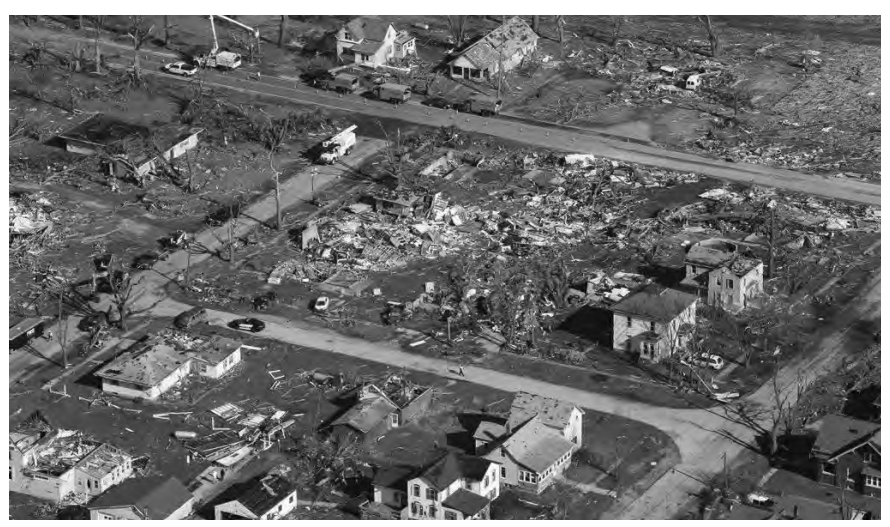
An EF-4 tornado tore through Fairdale and other northern Illinois communities on April 9, 2015, causing widespread destruction and two fatalities. IEMA coordinated the deployment of personnel and equipment to assist local responders with response and recovery efforts. To help people and businesses rebuild and recover from the tornado, the state secured a federal declaration from the U.S. Small Business Administration, which made low-interest loans available to people in nine northern Illinois counties.

The office maintains the Illinois Hazard Mitigation Plan, which guides the state's efforts to reduce the impact of future disasters resulting from any type of hazard. These