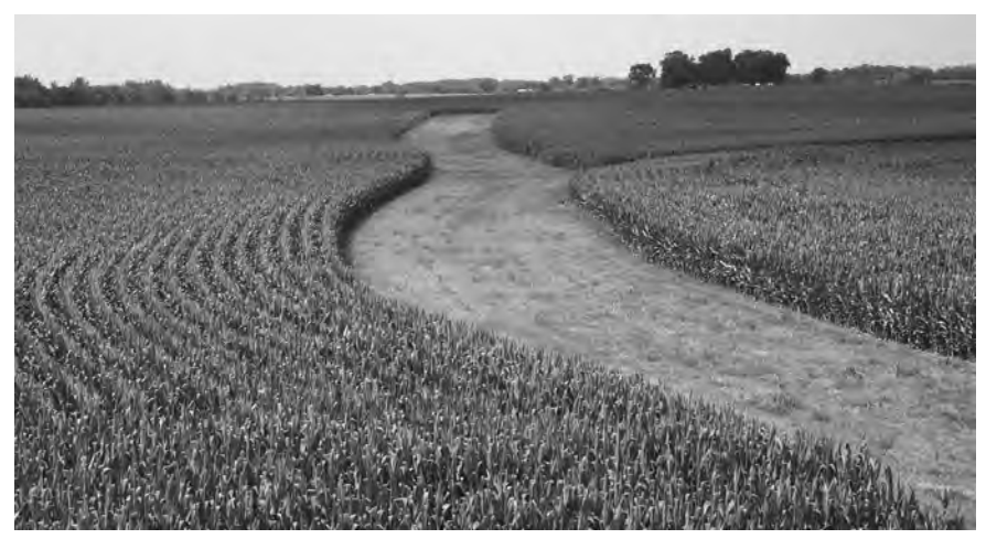
The Bureau of Land and Water Resources distributes funds to Illinois' 97 soil and water conservation districts for programs aimed at reducing soil loss and protecting water quality. The Illinois Department of Agriculture also operates the Henry White Farm, located in St. Clair County, which serves as an outdoor laboratory for research into sustainable agriculture, a system of farming that emphasizes profitability and natural resource protection.

Market service programs include the federal-state Livestock Market News Service and the Grain Market News Service, which supply current market information to buyers and sellers. The Illinois Field Office of the National Agricultural Statistics Service, operated in conjunction with the U.S. Department of Agriculture, provides information on crop production, livestock numbers, prices and related agricultural data.