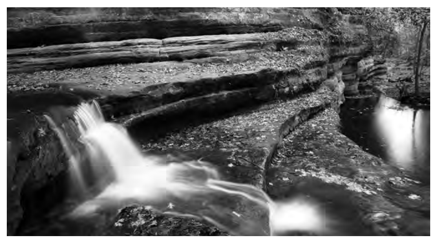
A 3.2-mile trail system provides visitors with picturesque overviews of a forested canyon at Matthiessen State Park in LaSalle County. Pictured is an area called Giant's Bathtub.

DNR is the lead state agency for water resources planning, navigation, floodplain management, the National Flood Insurance Program and interstate organizations on water resources. Interagency duties include the state water plan, drought response, flood emergency situation reports and the comprehensive review of Illinois water use laws. The Office of Water Resources regulates construction in the floodways of rivers, lakes and streams as well as public bodies of water and the shore waters of Lake Michigan; construction and operation of dams; diversion of water from Lake Michigan; and withdrawal of water from Lake Shelbyville, Carlyle Lake and Rend Lake. The primary capital activity of the office is to reduce urban flood damage.