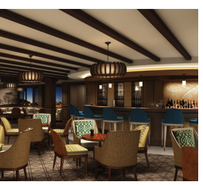
Sugarcane Mojito Bar

For those traveling solo, this lounge offers exclusive keycard access to a space where you can relax, watch the big screen TV and