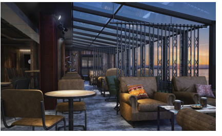
The District Brew House

Seating capacity 30 (560 sq. ft.) (52 m<sup>2</sup>)