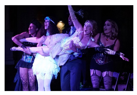
Happy Hour Prohibition - The Musical

Travel back to the eve of the Prohibition Era for a roaring good time with the interactive musical, Happy Hour Prohibition. Sip specialty cocktails from back in the day with Madam Lulu at her famous New Orleans speakeasy. Sit back and hear tales of underground bootleggers and find your toes tapping to some of the era's most popular tunes.