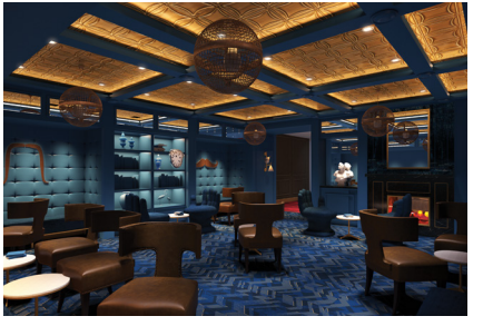
Social Comedy & Night Club

Pull up a chair inside – or oceanside on The Waterfront – in the legendary Liverpool club where The Beatles performed. Sip your Scotch Sour during an evening of good company and great music with a Beatles cover band. This is your ticket to ride down Penny Lane, perhaps in a Yellow Submarine. Seating capacity 118 (1,873 sq. ft.) (174 m<sup>2</sup>)