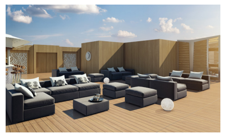
Vibe Beach Club

Seating capacity 195 (5,274 sq. ft.) (490 m<sup>2</sup>)