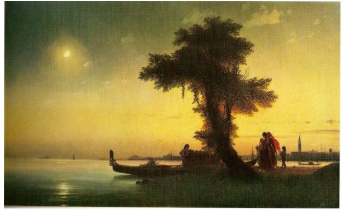
Aivazovsky ----- View of a Bay near Venice. ca. 1842 Oil on canvas, 75 x 119 cm.

Aivazovsky at 25 was Turner's 'Claudian Hope' incarnate. To emulate Claude after having experienced Aivazovsky's work would have been pointless exercise and truly a 'fallacious hope' for Turner at the age of 67. Thanks to that auspicious encounter, Turner relentlessly pursued his creative independence. A unique and essentially a revolutionary painter, Turner was no more in need of Ruskin's defence of his art of 1843 ( Modern Painters ). J. M. W. Turner had absorbed the Delphic Dictum. He knew himself. He became the Bard of Visual Culture for our own times and the millennium to come.