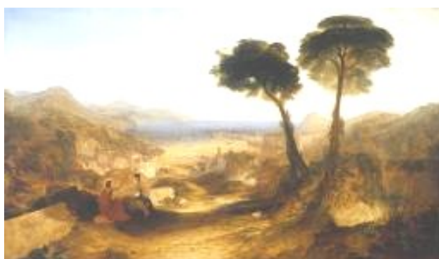
Turner’s painting: The Bay of Baiae, with Apollo and the Sibyl . Exh. BA 1823

Oil, 92 x 141 cm. now at Aivazovsky Gallery, Theodosia.