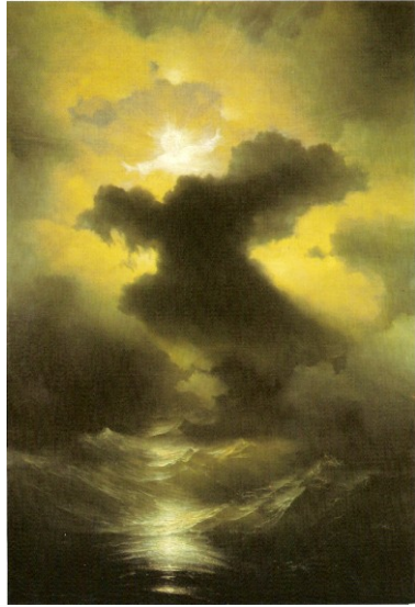
Aivazovsky's painting, Chaos—The Creation of the World . 1841.

Oil, 73 x 108 cm. The Mekhitarian St. Ghazar=Lazar Museum, Venice