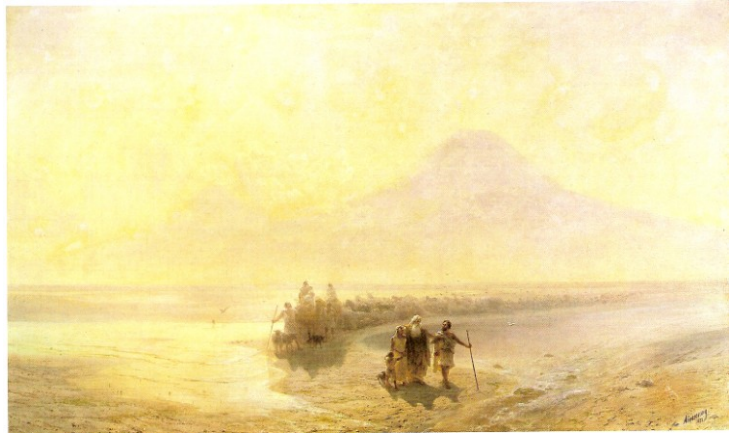
Aivazovsky---- Noah Descending from Ararat . 1887 Oil, 128 x 218 cm. Painting Gallery of Armenian. Yerevan

Nothing indeed could exemplify better the difference between the two painters as these paintings pertaining to the biblical events before and after the Deluge. Their formal and pictorial treatment of the same subject matter by both artists created the opposites in the classic-romantic dialectics of the spectrum of art.