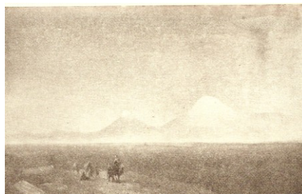
Aivazovsky--- The Valley of Mount Ararat . 1882