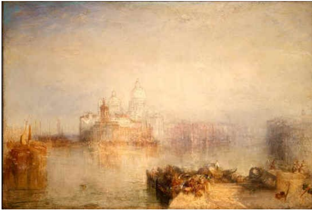
Turner's ---- The Dogana and, Santa Maria della Salute. Venice, 1843 Oil on canvas, 62 x 93 cm.