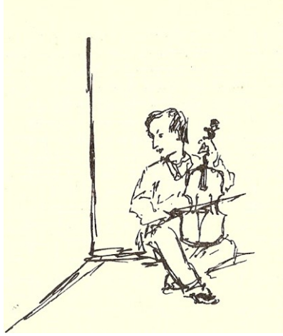
Aivazovsky's sketch/impression of himself as a young man playing the violin-oriental style. 1887.