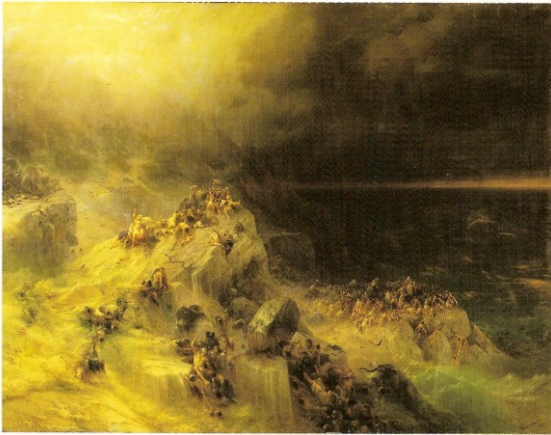
Aivazovsky---- The World Deluge . 1864 Oil, 246 x 369 cm. Russian Museum. St. Petersburg

is engulfed in a visually frozen battle/tension, a halted still of the natural tragic event – a Faustian augenblick , indeed, albeit not of bliss but of affliction.