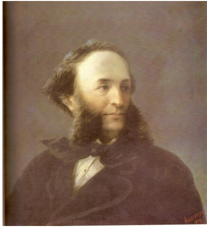
Aivazovsky's Self-portrait . 1874 Oil, 74 x 58 cm. Uffizzi Gallery, Florence.