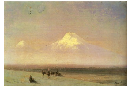
Aivazovsky.---- Mount Ararat . 1885

But in 1887, Aivazovsky too, like Turner, painted mount Ararat’s biblical theme of ‘after the Deluge.’ He named it simply as Noah Descending from Ararat . As mentioned above, the subject matter in Turner’s painting of Ararat after the Deluge is swept up in the dynamic vortex of regeneration. In Aivazovsky, the vast emptiness of the world-universe after the Deluge, the majesty of mount Ararat and the chilling serenity of the disciplined descent of the survivors, all breathe Biblical inevitability. Moreover, in the Aivazovsky oil painting Noah’s group has chosen to bend the path of the caravan in a semicircle (the painter has modified the straight path of the caravan in his initial sketch.) The Patriarchal group is pushed further away from his followers, in an anticlockwise motion, towards the right, thus creating a guiding momentum for the bewildered survivors in their descent.