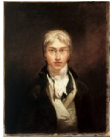
Turner's Self-portrait . c.1798 Oil, 29 x 23 inches. Tate gallery, London

Once upon a time there was Hovhanness Haivaz, an Armenian lad born in Theodosia, the “God-given” city built by the ancient Greeks on the shores of the black sea in Crimea. He had the gift of the muses. He soon began singing, playing the violin – oriental style—and drawing on the walls with charcoal.