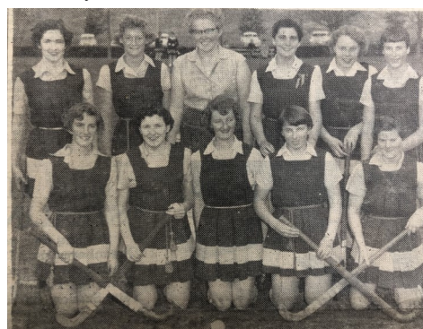
Evergreens, ACT Women's Hockey Champions, 1957