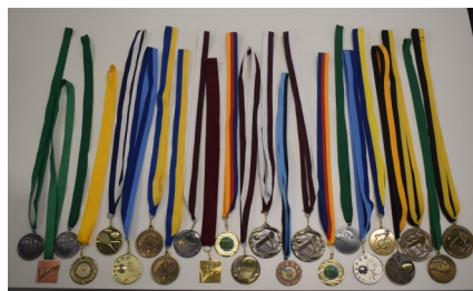
Australian and World title Medals to date, 2021)