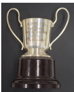
ACT Girls Under 17 Singles Cup, 1957