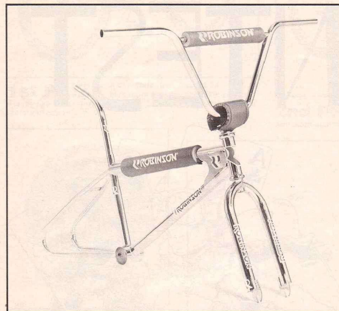
Robinson components; the end result of eleven years of BMX experience. Qual stuff . . . at a price.

justment through the full range of axle adjustment. The hell-arc welding is very good throughout, with an even bead and apparently good penetration. Chrome-plating is excellent.