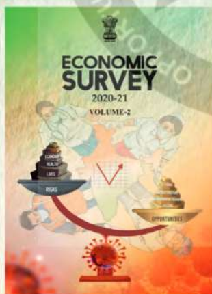
ECONOMIC SURVEY 2020-21 Volume-1 & 2

Views expressed are personal