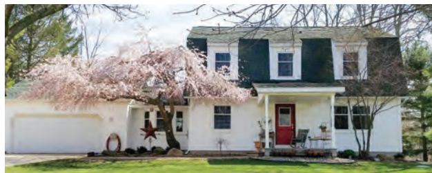
Home in early spring

9. As you think about the home in which you grew up, what elements did you like and do you think you have incorporated some of them in your own home? As I mentioned, my father was an architect. The home I spent most of my childhood in was designed by him and it was designed completely into