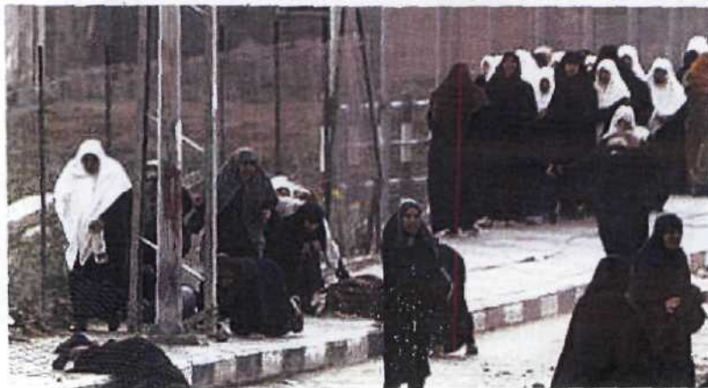
In history of humanity there were heinous crimes committed in the name of god and religion!