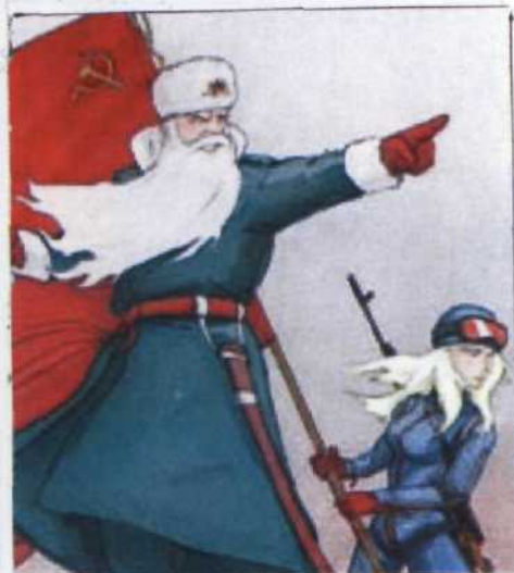
Father Frost is showing the road forward to Socialism and USSR!