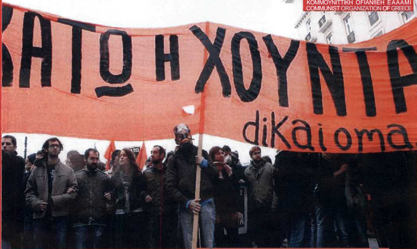
Photo from the demonstration of the Young Workers Union "Dikaioma" during the General Strike of 15 December 2010

Sagvari was the leader of the illegal Communist Party and one of the leaders of the Social Democratic Party, and he died a