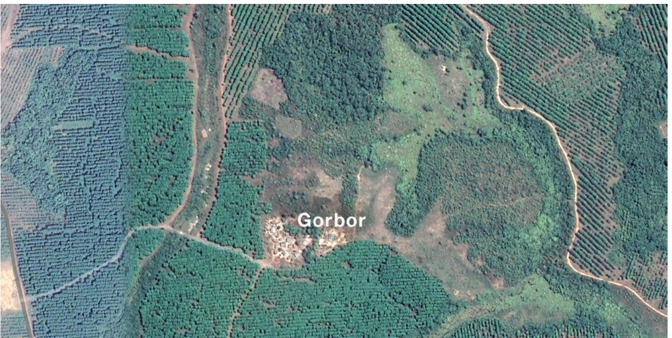
This satellite image shows how close the plantation's rows of rubber trees are to the houses in Gorbor village.