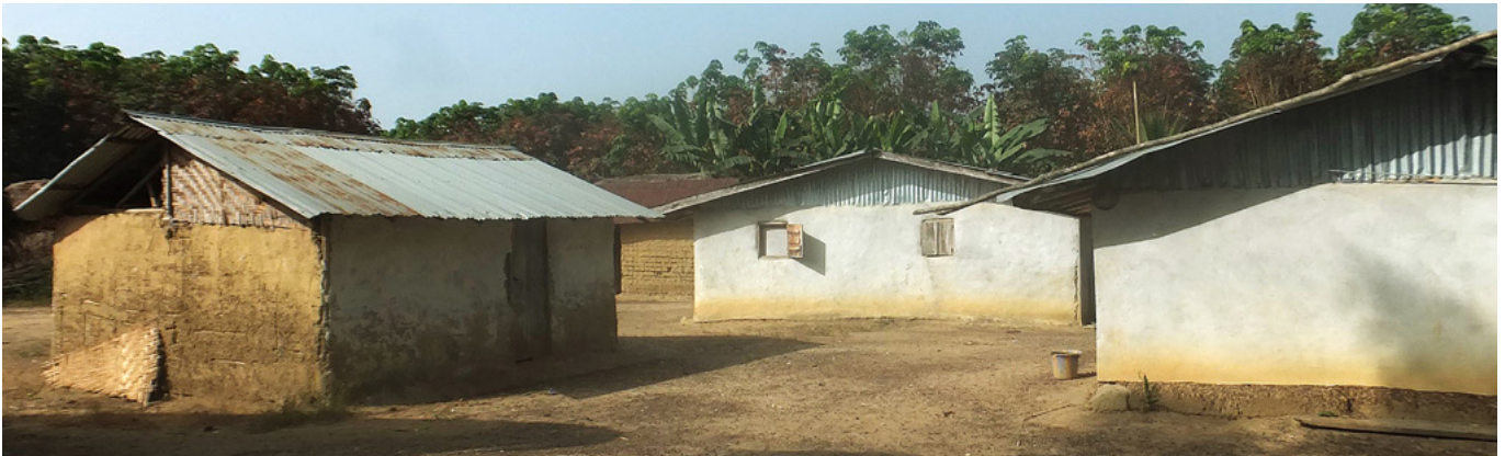
Houses of Gorbor. The rubber plantation visible in the background starts just behind the houses.