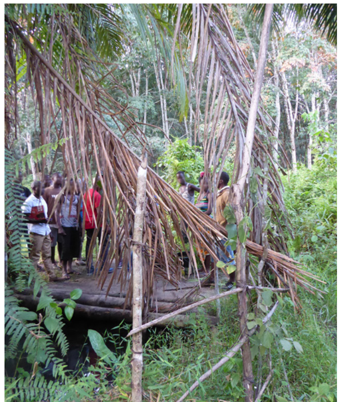
Creek for drinking water next to the rubber plantation (visible in the background) in Jorkporlorsue

Loss of land is usually combined with a change in access to water. The IFC Standards clearly demand that water pollution must be avoided or minimized, and that additional impacts on water availability and quality must be compensated or offset. The current situation for communities affected by the plantations abuses their right to water, stated as a human right in the International Covenant on Economic, Social and Cultural Rights.