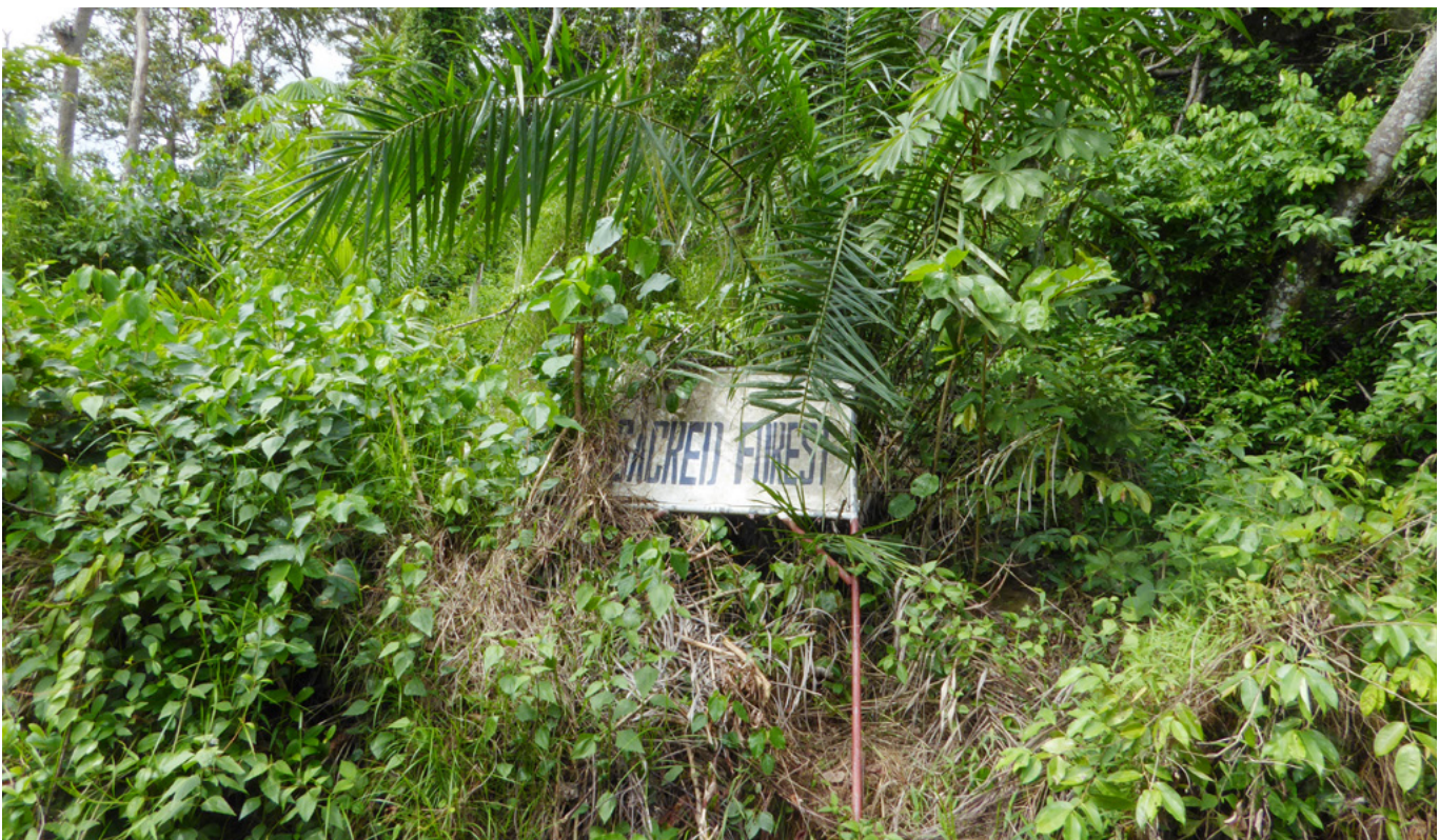
Preserved remains of Garjay's sacred forest, now desecrated because it is surrounded by the plantation

"To that we said absolutely NO, NO ... If they evict us from here, where do we go? If I go to another county, I will remain a stranger until I die." Elder in Zondo