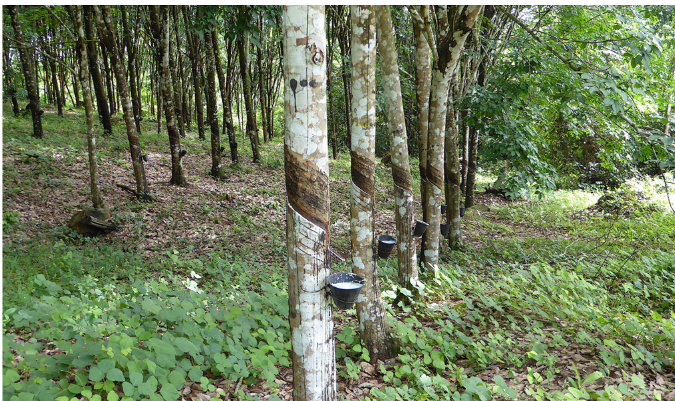
Rubber production at the Liberian Agricultural Company (LAC) plantation.