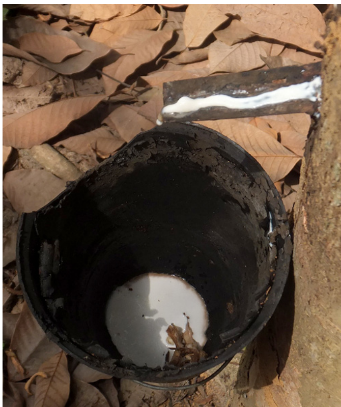
Latex flowing into a cup on a smallholder rubber farm.