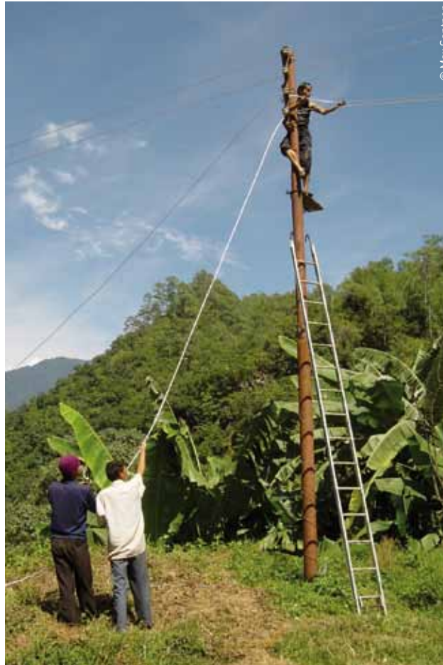
Rural electrification in Zhemgang.

Austrian Resident Coordinator from 1999 to 2004