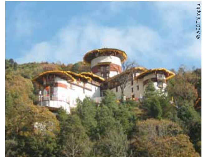
Inauguration of Ta Dzong 2006

The first inspection of the building's condition revealed poorly fitted rough stone laid in thick mud mortar, its massive walls had cracks and deep fissures indicating poor stone quality