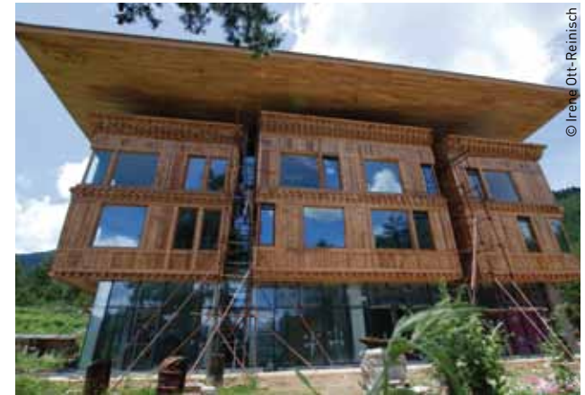
The 4-star training hotel is close to completion.

The last and most challenging part of the construction project is the construction of a new hotel building which will serve as a training hotel for the students of the RITH. The strict building rules in order to conserve “traditional looks” with a large number of rabsey (light weight timber frame constructions with window openings) were very demanding for the energy optimised building standards. Ms. Irene Ott-Reinisch, the Austrian architect, had to reconcile Bhutanese tradition and innovation. “Building on our experience gained in the renovation of the Training Institute, I had to develop a new interpretation of the traditional Bhutanese farm-