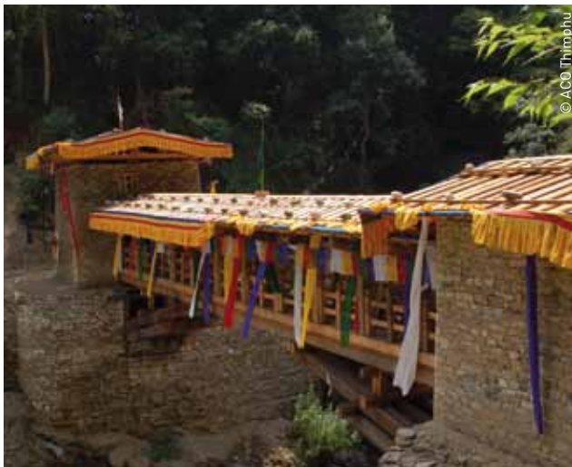
Inauguration Cantilever Bridge 2007

(mainly mica schist) and failing foundations. The renovation work started in 2005 and turned out to be much more difficult than anticipated. In July 2006 a portion of the three metres thick walls of the main tower collapsed, leading to a complete reconstruction while trying to retain the historical character and unique appearance of the building.