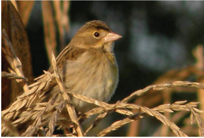
Dickcissel ( Spiza americana ). Benjamin Rush State Park, Philadelphia, 6 October 2009. (Frank Windfelder)