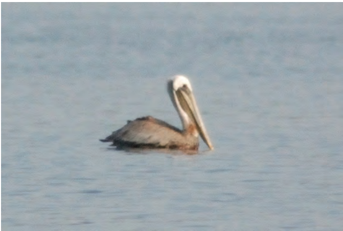
Brown Pelican ( Pelecanus occidentalis). This bird appeared on the Susquehanna River at Peach Bottom, Lancaster, 3 August 2009 after it had been seen the previous day just five miles south of the border in Maryland.