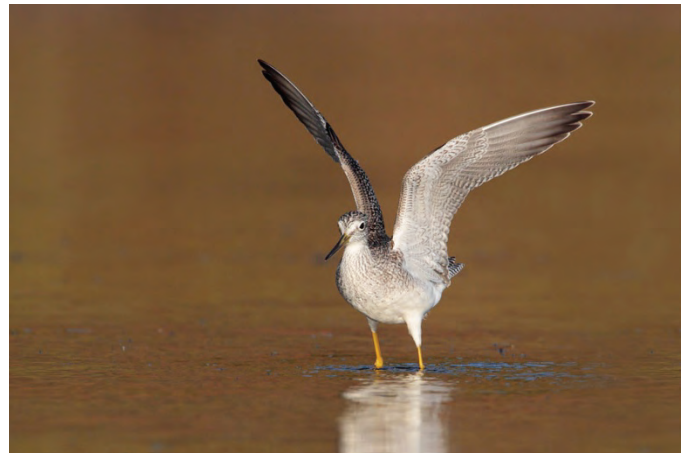
Greater Yellowlegs ( Tringa melanoleuca ). One of a flock of up to 16 which stayed at Independence Marsh, Beaver, through the last two weeks of October, photographed here 18 October 2009.