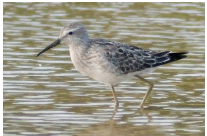
Stilt Sandpiper ( Calidris himantopus ). Green Pond, Northampton, can always be counted upon for some nice shorebirds; this Stilt was photographed there 6 September 2009.