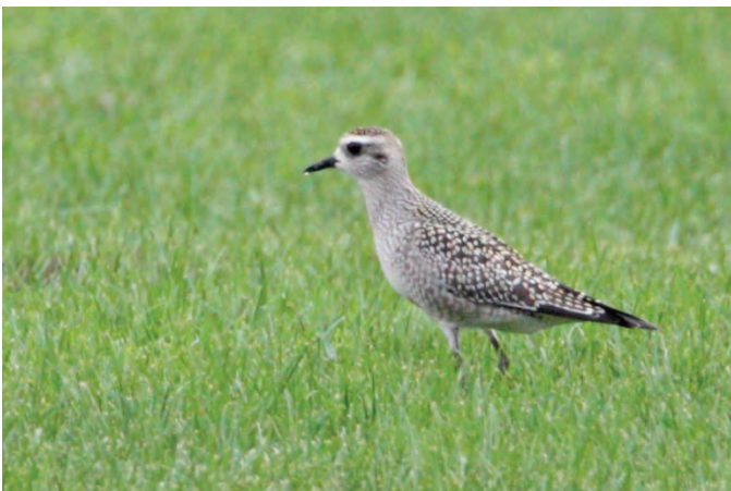
American Golden-Plover ( Pluvialis dominica ). Present at Independence Marsh, Beaver, 22 to 25 September 2009, it was also found a few miles away in Hanover Twp., where this photo was made 23 September.