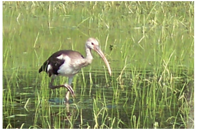
White Ibis ( Eudocimus albus ). Continuing a streak of late summer sightings in Pennsylvania was this juvenile near Picture Rocks, Lycoming , 7 August 2009.