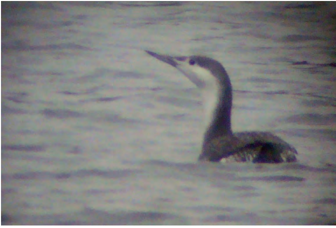
Red-throated Loon ( Gavia stellata ). A fallout of Red-throated Loons in several western counties happened 22 November 2009, which included this bird at Crooked Creek, Armstrong , where the species is very unusual. ( Marge Van Tassel )