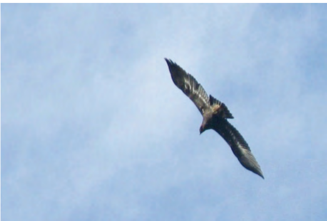
Golden Eagle ( Aquila chrysaetos ). Bucktoe Preserve, Chester , 18 November 2009. ( Derek Stoner )