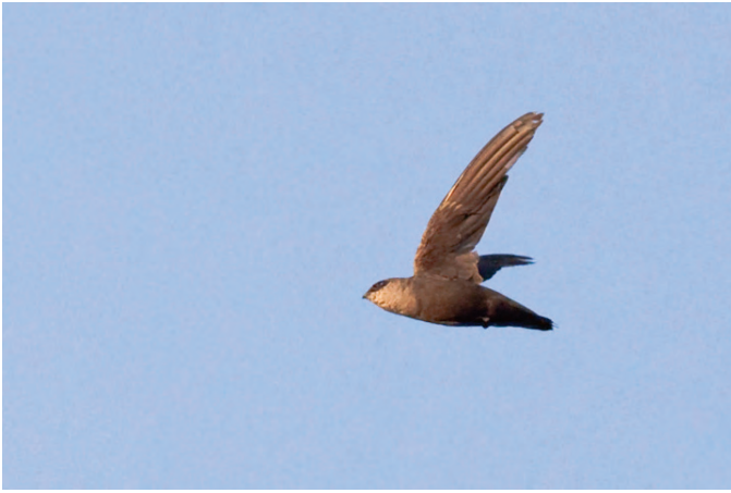
Chimney Swift ( Chaetura pelagica ). Chimney Swift is a species not often well-photographed while in flight; this fine image was made in Houston, Washington, 17 August 2009.