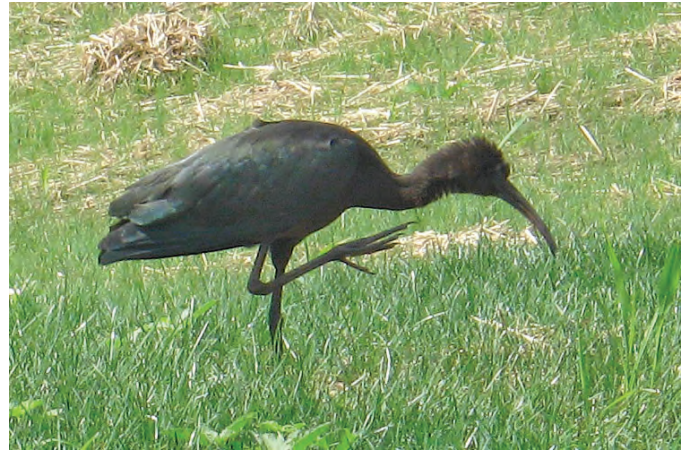
Glossy Ibis ( Plegadis falcinellus). Spring Township, Berks, 16 August 2009.