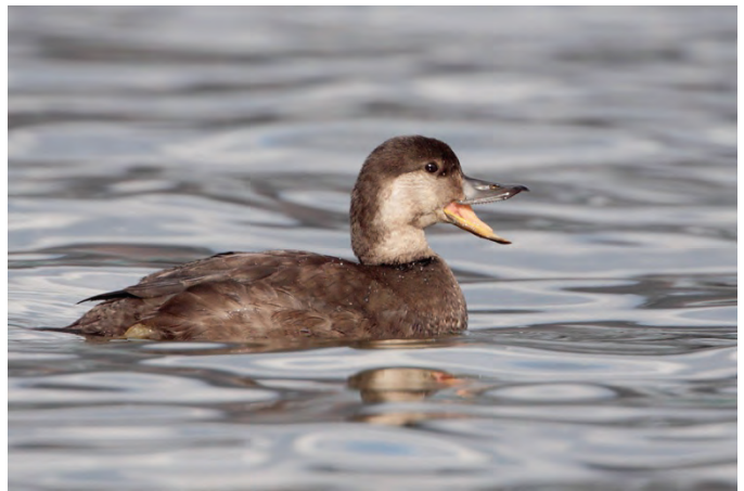
Black Scoter ( Melanitta niger ). Allegheny birders were also afforded a rare encounter with this species in late November, when this first winter (probably female) bird attended the riverbank at Dashields Dam 20 (here) to 28 November 2009. (Geoff Malosh)