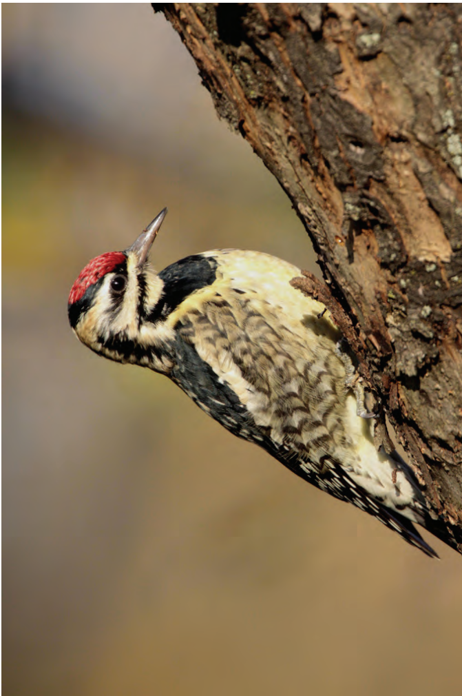
Yellow-bellied Sapsucker ( Sphyrapicus varius). This outstanding image was made in a backyard in Bath, Northampton, 18 November 2009.