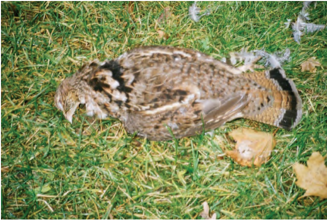
Ruffed Grouse ( Bonasa umbellus). A species which certainly does not need any more adversity is Ruffed Grouse; this bird died shortly after striking a window in Warren 21 November 2009.