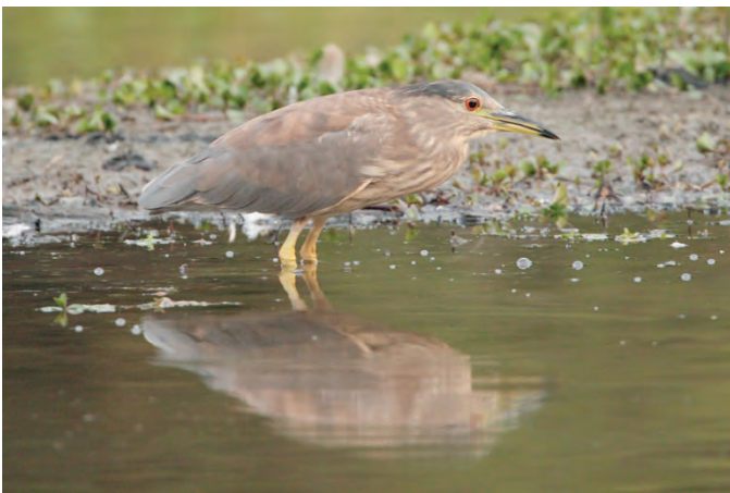
Black-crowned Night Heron ( Nycticorax nycticorax ). Possibly on the increase in Allegheny is Black-crowned Night-Heron; this bird was one of at least two present through much of the summer at North Park, here 15 August 2009.