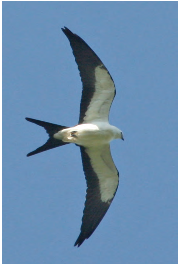
Swallow-tailed Kite ( Elanoides forficatus ). Near Militia Hill hawk watch, Montgomery , 1 September 2009. ( Devich Farbotnik )