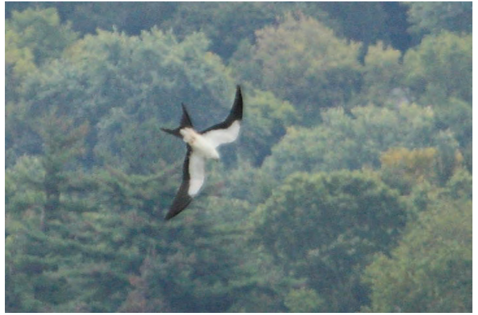
Swallow-tailed Kite ( Elanoides forficatus ). This bird, present near the Militia Hill hawk watch, Montgomery , 27 August to 5 September (here 31 August), was certainly one of the most easily chased of its kind in the state's history; it spent most of its time hawking dragonflies over a nearby golf course and was seen by dozens.