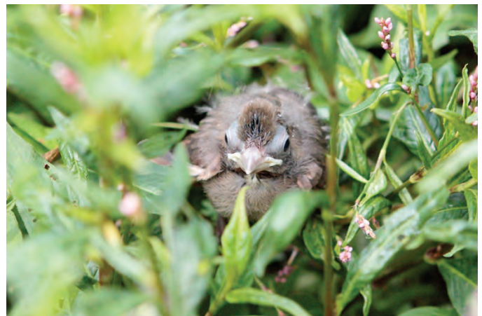
Northern Cardinal ( Cardinalis cardinalis ). A second-brood fledgling photographed 14 August 2009 in a Moon Township (Allegheny) yard.