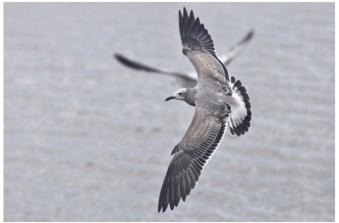
Laughing Gull ( Larus atricilla ). Another surprise at the Pymatuning Spillway in Crawford was this first year Laughing Gull, photographed there 14 September 2009. The spillway is obviously a place with great potential for stray gulls and waterfowl and deserves more recognition as such.