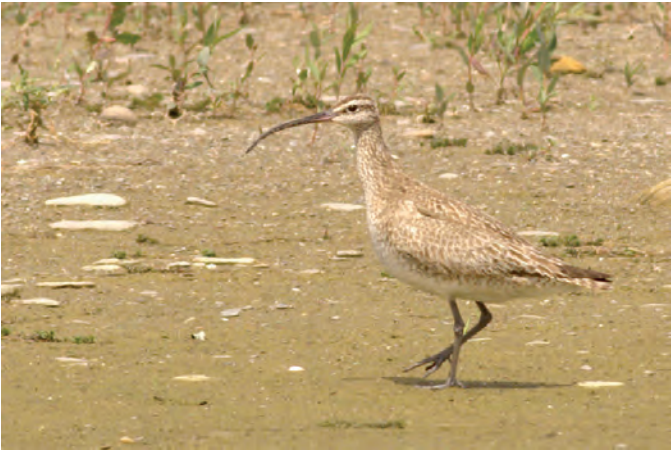
Whimbrel ( Numenius phaeopus). One of a very few found in the state this fall was this Whimbrel at Gull Point, Erie, 23 August 2009.