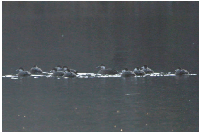
Black Scoter ( Melanitta nigra ). Western Pennsylvania saw an above average flight of this species, headed by this group of 12 (11 shown here) at Washington Reservoir #4, Washington , 8 November 2009. (Ross Gallardy)