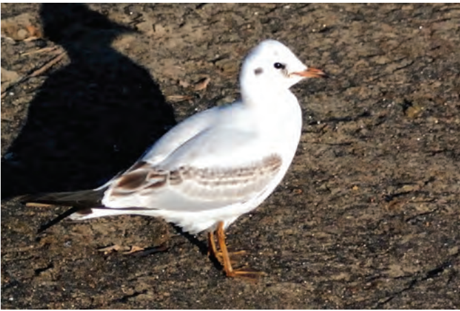
Black-headed Gull ( Larus ridibundus ). This first winter bird was a coincidental find at the Forks of the Delaware in Northampton during a search for an adult of the same species which had been seen recently in nearby New Jersey. It was present 18 to (here) 21 November 2009. (Dave DeReamus)