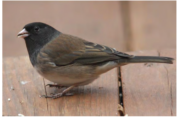
Dark-eyed (Oregon) Junco ( Junco hyemalis). West York, York, 23 November 2009.