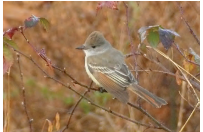
Ash-throated Flycatcher ( Myiarchus cinerascens ). 22 November 2009 near Mt. Gretna, Lebanon. The bird would represent the state's fourth record if accepted. (Larry Usselman)