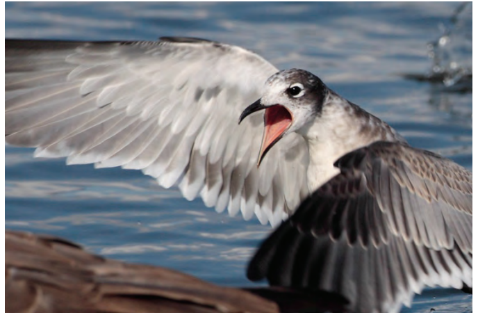
Franklin's Gull ( Larus pipixcan ). An action shot of the Franklin's Gull at the Pymatuning Spillway, Crawford , 31 August 2009, as it asserted itself among a flock of Ring-billed Gulls and mallards. (Geoff Malosh)