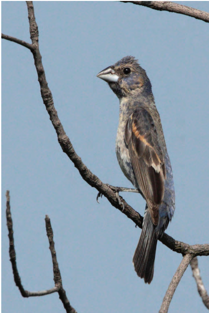
Blue Grosbeak ( Passerina caerulea ). A first fall male at Lehigh Gap Wildlife Refuge, Carbon, 18 August 2009.