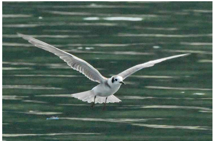
Black Tern ( Chlidonias niger ). A nicely-captured juvenile in Bucks 24 August 2009. (Howard B. Eskin)