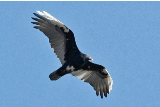
Turkey Vulture ( Cathartes aura ). This partially leucistic vulture was photographed near Carlisle, Cumberland , 7 November 2009. ( Meredith Lombard )