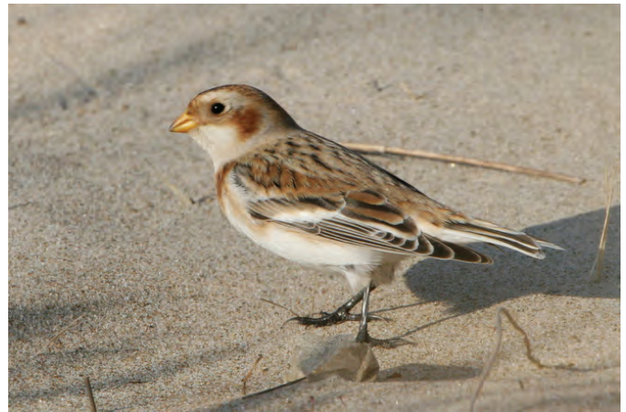
Snow Bunting ( Plectrophenax nivalis ). Even in years when the species is late arriving, as they were in 2009, the Lake Erie shore can be counted upon for Snow Buntings in November. This bird was photographed at Presque Isle State Park 8 November 2009. (Ross Gallardy)