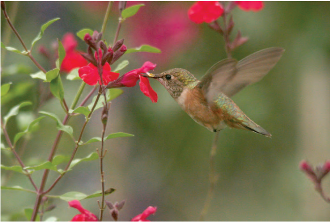
Rufous Hummingbird ( Selasphorus rufus). One of 10 Selasphorus hummingbirds found in Pennsylvania this season, nine of which were confirmed as Rufous, this bird was photographed at Ephrata, Lancaster, 3 November 2009.