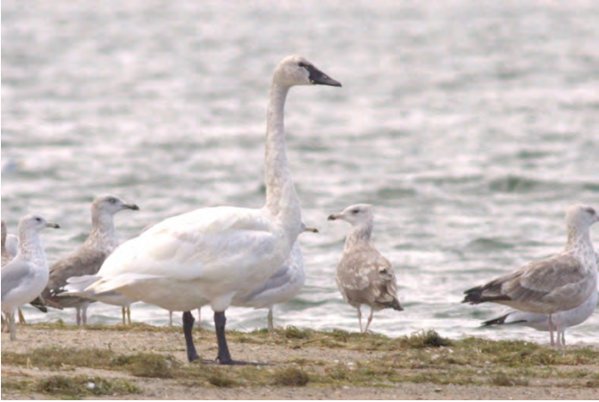
Tundra Swan ( Cygnus columbianus). This Tundra Swan in Erie provided a rare summer record by staying around Gull Point for several weeks in July and August. Photographed here 23 August 2009.