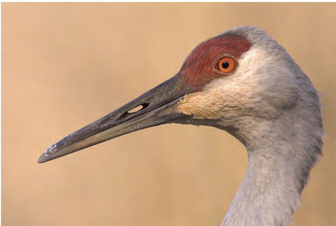
Sandhill Crane ( Grus canadensis). This long-staying bird at Lake Duffy, Lebanon, has become accustomed to human presence and thus has become one of the most viewed Sandhills in the state's history. Photographed here 29 November 2009.