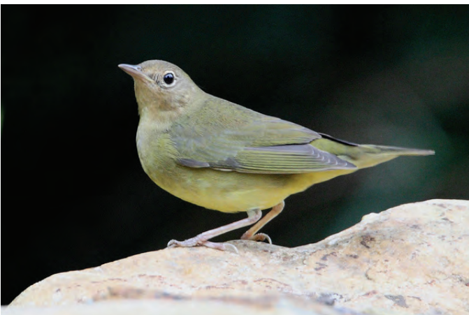
Connecticut Warbler ( Oporornis agilis ). Normally secretive, this Connecticut nonetheless took a moment to pose for a camera in Bath, Northampton, 22 September 2009. It was a very good season for the species with reports from 13 counties. (Dustin Welch)