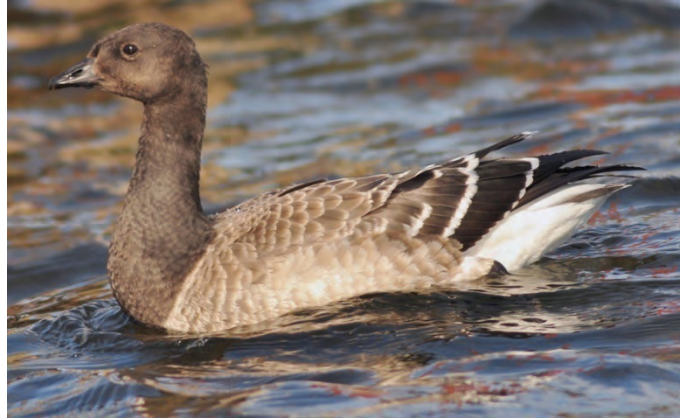
Brant ( Branta bernicla ). Another view of the juvenile at Conneaut Lake, Crawford , 9 November 2009. (Scott Kinzey)