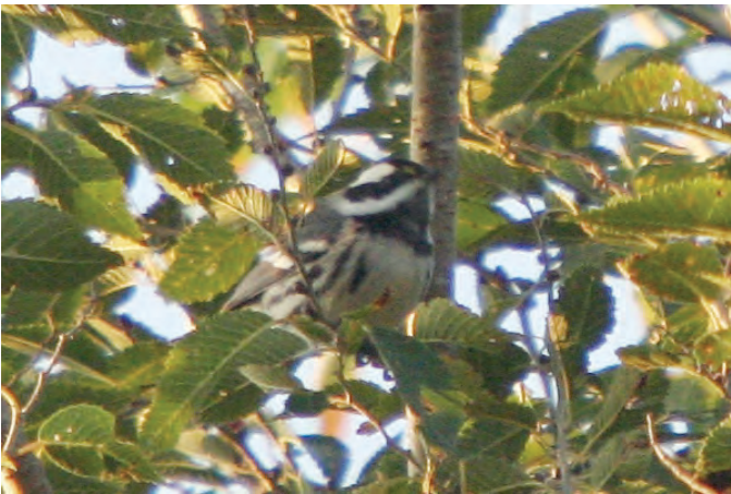
Black-throated Gray Warbler ( Dendroica nigrescens ). Another exciting rarity for the season was this male Black-throated Gray Warbler at Big Spring in Cumberland. It was present 20 (here 21) to 25 October 2009, long enough to be seen by nearly 100 birders. (Andrew Markel)