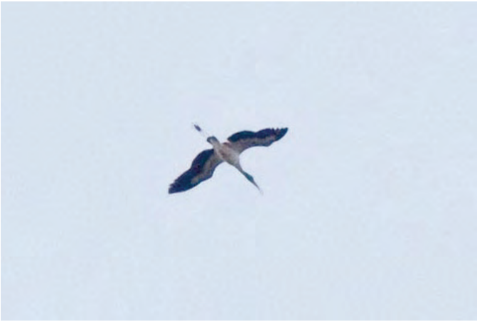
Wood Stork ( Mycteria americana ). A few lucky observers caught a glimpse of this bird as it passed over the Militia Hill hawk watch in Montgomery 25 October 2009. ( Jamie Stewart )