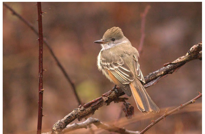
Ash-throated Flycatcher ( Myiarchus cinerascens ). 26 November 2009 near Mt. Gretna, Lebanon. (Tom Johnson)