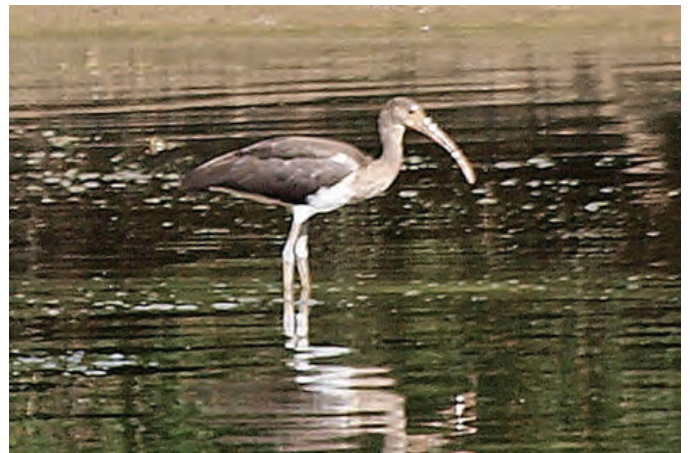
White Ibis ( Eudocimus albus ). Though the state has had a few good years in a row for White Ibis, the appearance of one away from the southeast is always unexpected, so this juvenile was very surprising at Shenango Reservoir, Mercer , 1 September 2009.