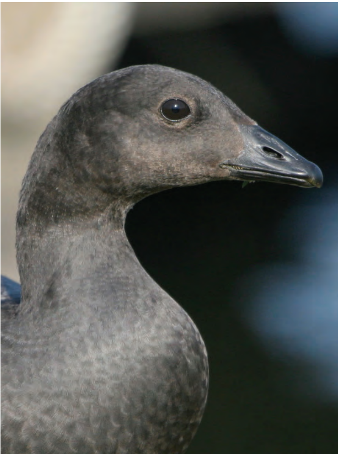
Brant ( Branta bernicla ). This accommodating juvenile appeared at Conneaut Lake, Crawford 25 October 2009, where it stayed to 19 November (here 8 November) feeding on the lawn on a public boat launch and allowing extraordinarily close scrutiny. (Ross Gallardy)