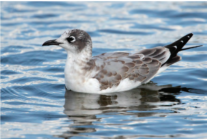
Franklin's Gull ( Larus pipixcan ). This fearless juvenile Franklin's was present at the Pymatuning Spillway, Crawford , 31 August (here) to 3 September 2009, where it squabbled with the resident mallards and carp for scraps of bread thrown by the spillway's many human visitors. (Geoff Malosh)