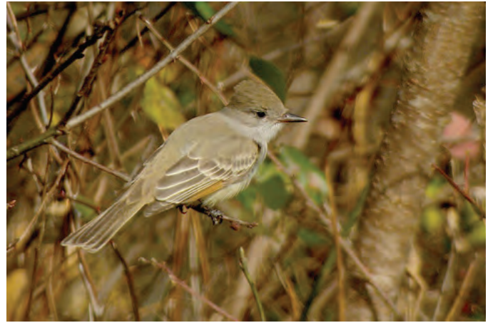
Ash-throated Flycatcher ( Myiarchus cinerascens ). One of the more memorable rarities in recent years was this confiding Ash-throated Flycatcher near Mt. Gretna, Lebanon, 20 (here 21) to 28 November 2009.