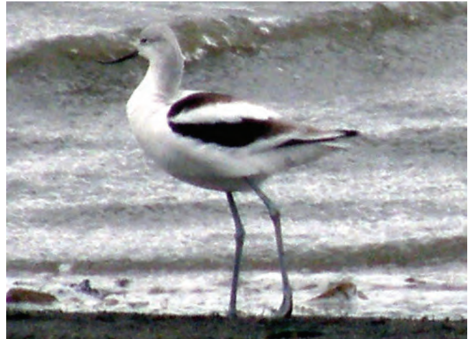
American Avocet ( Recurvirostra americana). This female provided a late-November surprise at Kahle Lake in both Clarion and Venango; it was present 23 to (here) 30 November 2009.