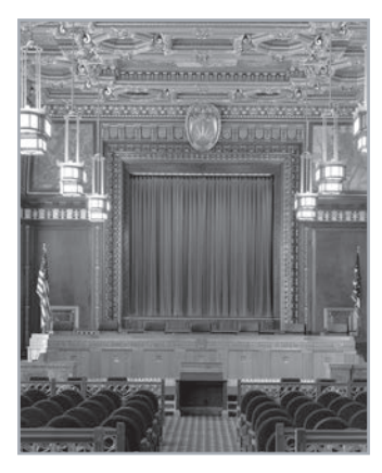
Normally, arguments are limited to 15 minutes per side.

The chief justice announces the first case and the name of the attorney who will make the first presentation. The attorney walks to the lectern in front of the bench and begins the argument. Normally, arguments are limited to 15 minutes per side, but in some cases the time increases to 30 minutes.