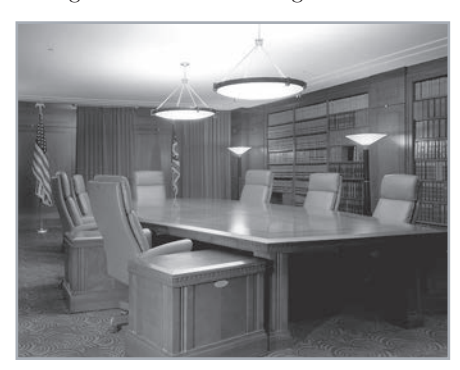
The justices vote on cases in the deliberation room.

When the majority opinion is written, it is circulated to members of the Court for comment. Members in the