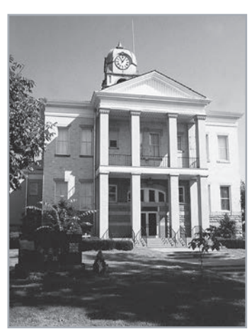
Adams County Courthouse West Union

Judges sitting in these courts, like probate judges, have the authority to perform marriages.