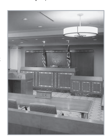
Ohio Court of Claims Courtroom Moyer Judicial Center

Civil complaints filed for $2,500 or less are decided on the contents of the case file or "administratively" by