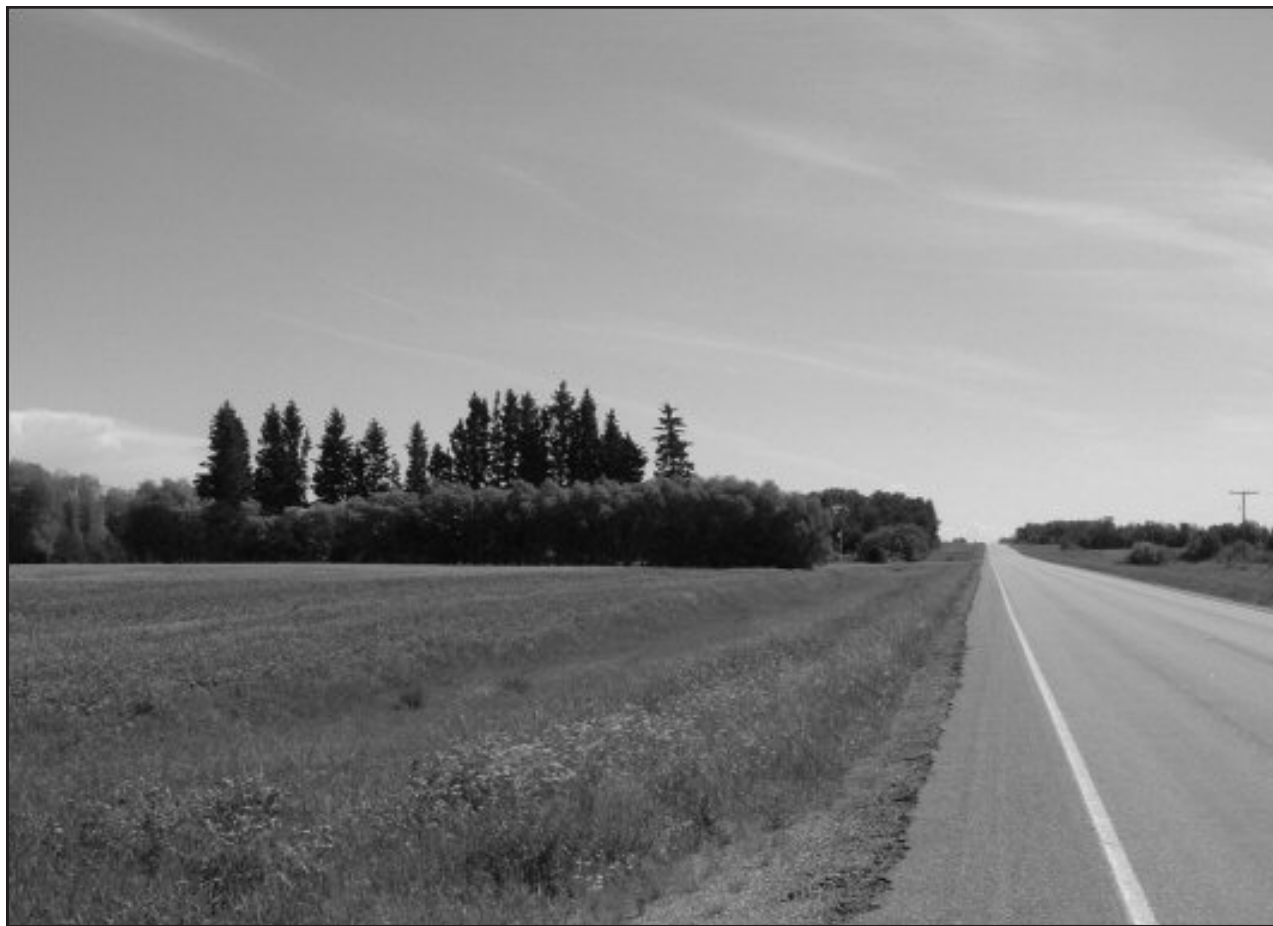
A line of spruce trees marks the central street of Vozvyshenie.

rare and the Doukhobor values of love, non-violence, hospitality, simple living and justice prevailed in day to day relations.