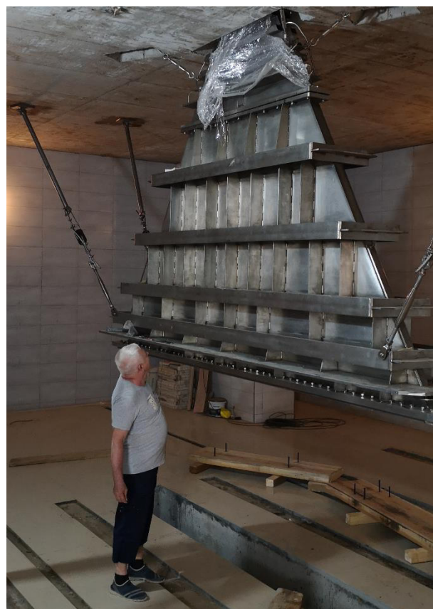
Figure 4: Four meters width extraction device.