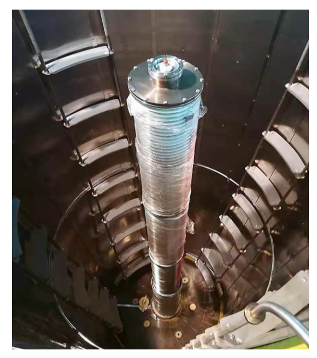
Figure 2: The ELV-15 accelerating tube.

Accelerating tube view and the common view of the ELV-15 accelerators are shown on Figs. 2 and 3.