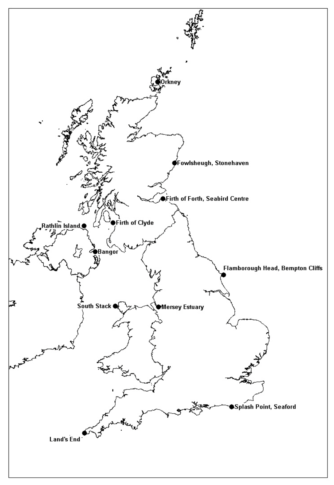
Fig 4. Map of selected seabird watching locations in the UK, 2005.