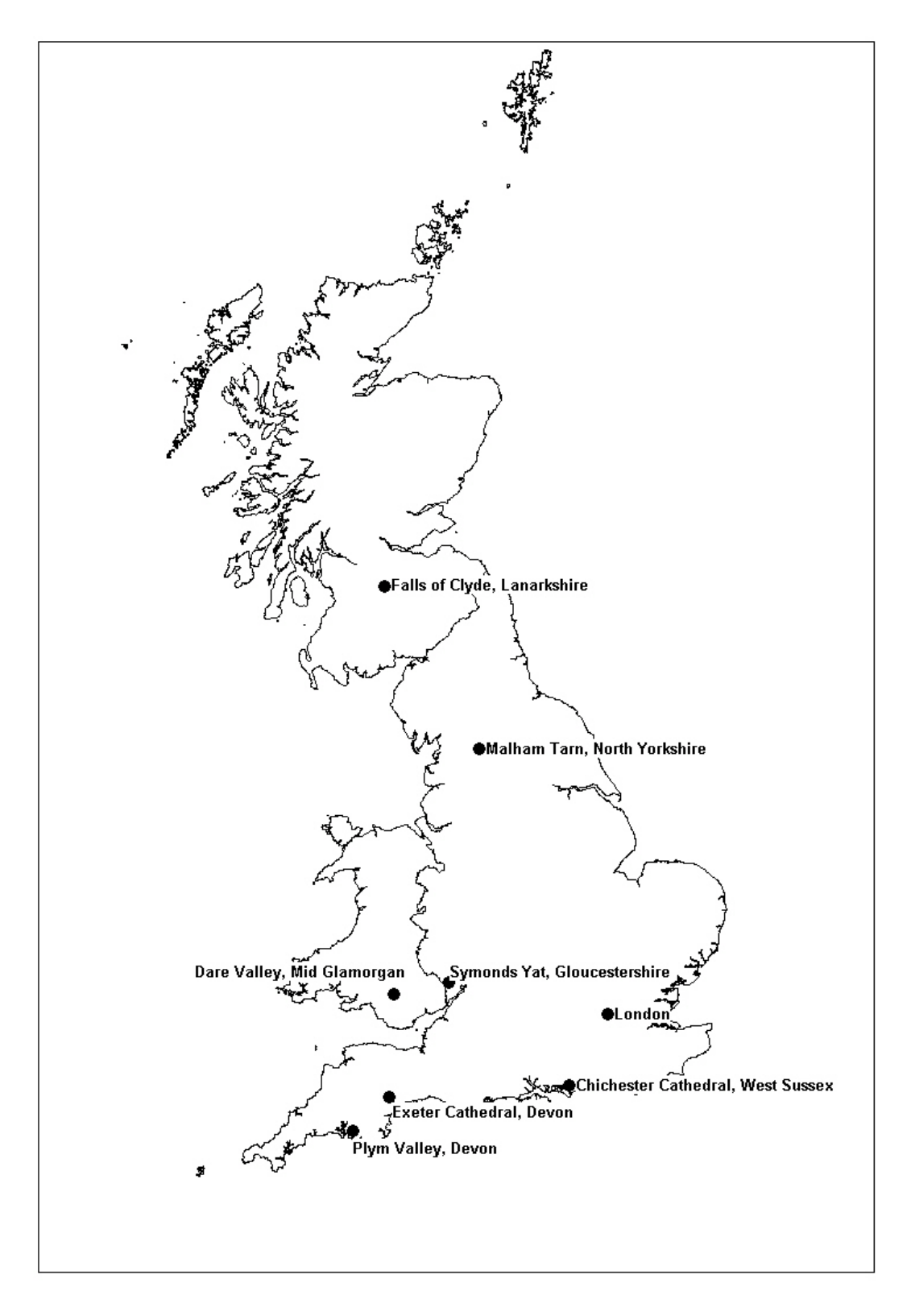
Fig 3. Map of organised UK peregrine watch points featured in this report.