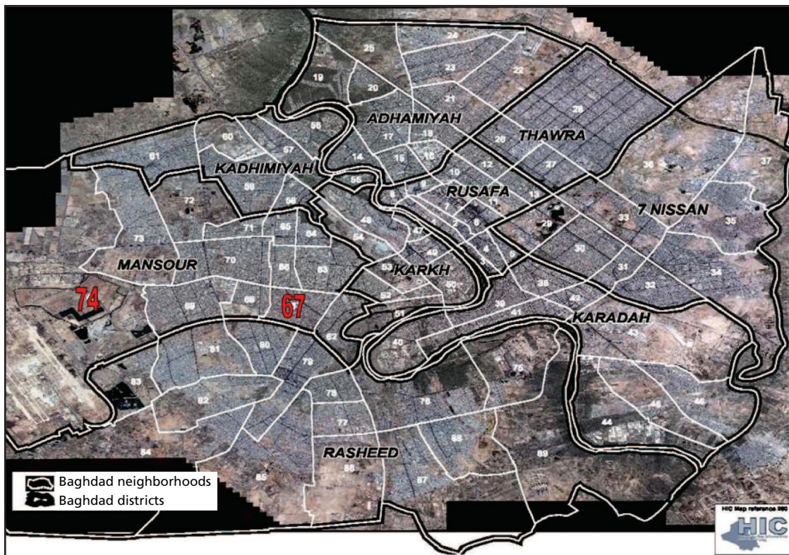
Figure 1.1 Baghdad Districts and Neighborhoods, 2007

The boundaries and names shown and the designations used on this map do not imply official endorsement or acceptance by the United Nations.