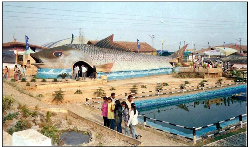
The Pisiculture Pavilion

governments together to highlight each of their unique attractions. Key participants included various ministries/departments of the Government of India, the ICAR, agricultural universities and private sector organisations.