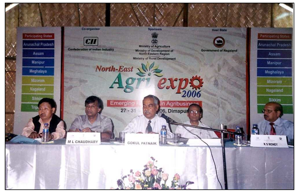
Seminar on North East Agri Expo

The North Eastern states have a unique ecology with a wide variety of flora and fauna. The agro climatic condition of these states is particularly conducive for growing a wide array of agricultural crops. The region also has vast potential to do border trade with ASEAN countries due to its close proximity. However, adoption of technology and efforts for enhancement of productivity in the NE region has remained poor despite many efforts.