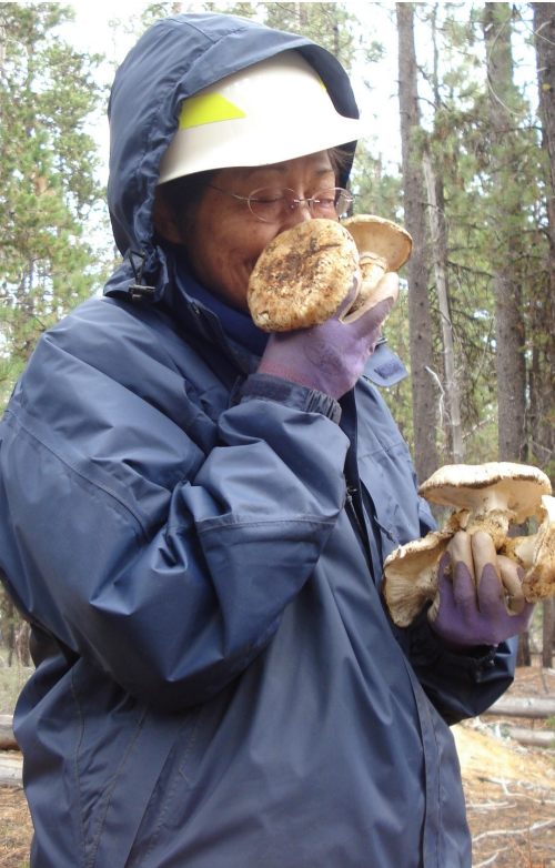
A volunteer enjoys the unique matsutake aromas during the surveying process.

With the final round of DNA analysis complete, results showed that the matsutake maintained its presence in treated areas. DNA surveys showed a 63% detection of matsutake postforest treatment in the control blocks-areas untouched during thinning. DNA analysis found a 61% detection rate of matsutake in areas that received thinning. These results sup-