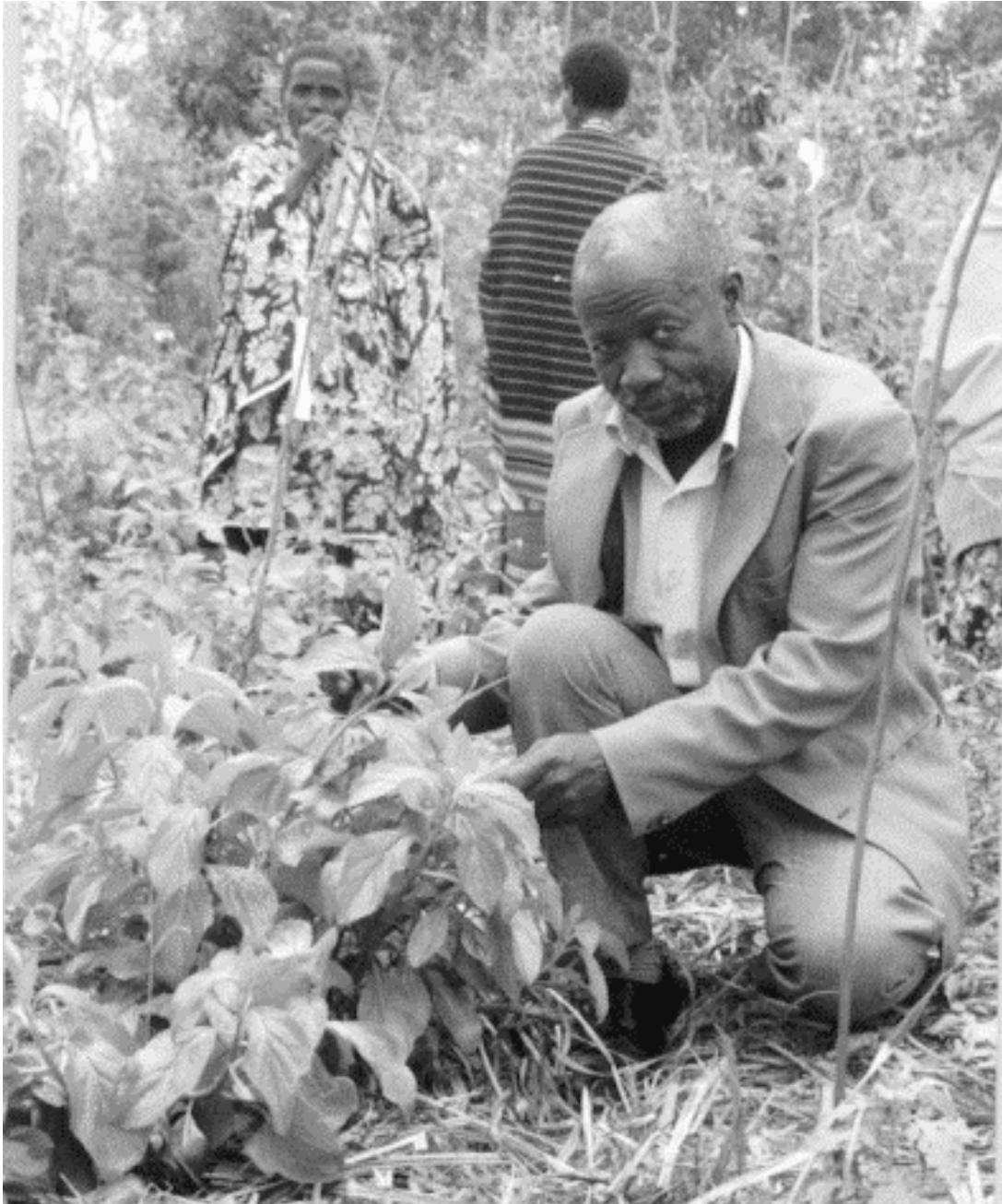
A healer tends a herbal garden in Mbarara, western Uganda.