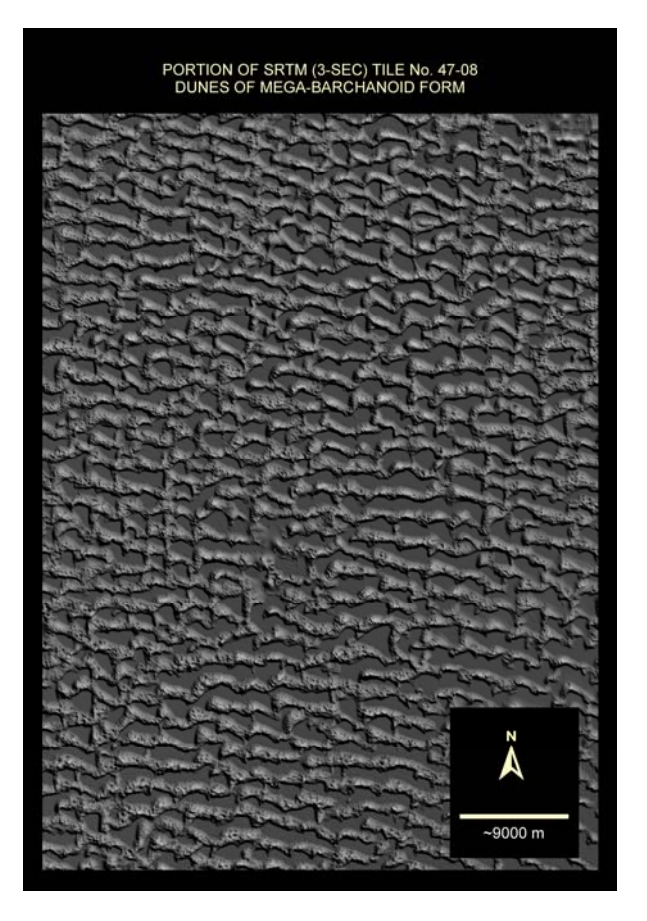
Figure 2. Radar part-image (image center ~54.183°E, 22.278°N) of the Rub' al Khali mega-barchanoids.

compound forms. Therefore, it is plausible that spatial statistical indices may indicate a relative scale from which dune field maturity can be ascertained across a variety of scales. These results parallel the views of Wilkins and Ford [2] who suggest that eolian systems reflect, within different spatial regions of the field, the sum of changes that result in the spatially variable states of dune field organization.