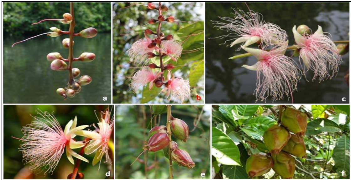
Figure 2: Barringtonia racemosa ; a. Hanging inflorescence in bud phase; b. Inflorescence in flowering phase; c-d. Close-up view of flowers; e. Fruits in development phase; f. Fully developed fruits.

As soon as the mature buds opened, they were foraged for nectar by the hawk moths Agrius convolvuli L., Macroglossum sitiene Walker, M. gyrans Walker, Nephele hespera Fabr. and Hippotion rosetta Swinhoe. They visited the flowers very swiftly usually from base to top and occasionally from top to base. They hovered at the flowers, inserted the proboscis and obtained nectar in one to two seconds. In so doing, their proboscis, head and underside of wings contacted the stigma and stamens and this contact facilitated pollen transfer from the stamens to the moths and from moths to the stigma resulting in pollination. As they were swift fliers, they foraged numerous flowers on different racemes on different plants in quest of more nectar and thereby promoted the rate of cross-pollination. The foraging activity of moths ceased after 21:00 h. The flowers were not visited by any other animals later in the night and also on the next day, before the fall of the staminal mass.