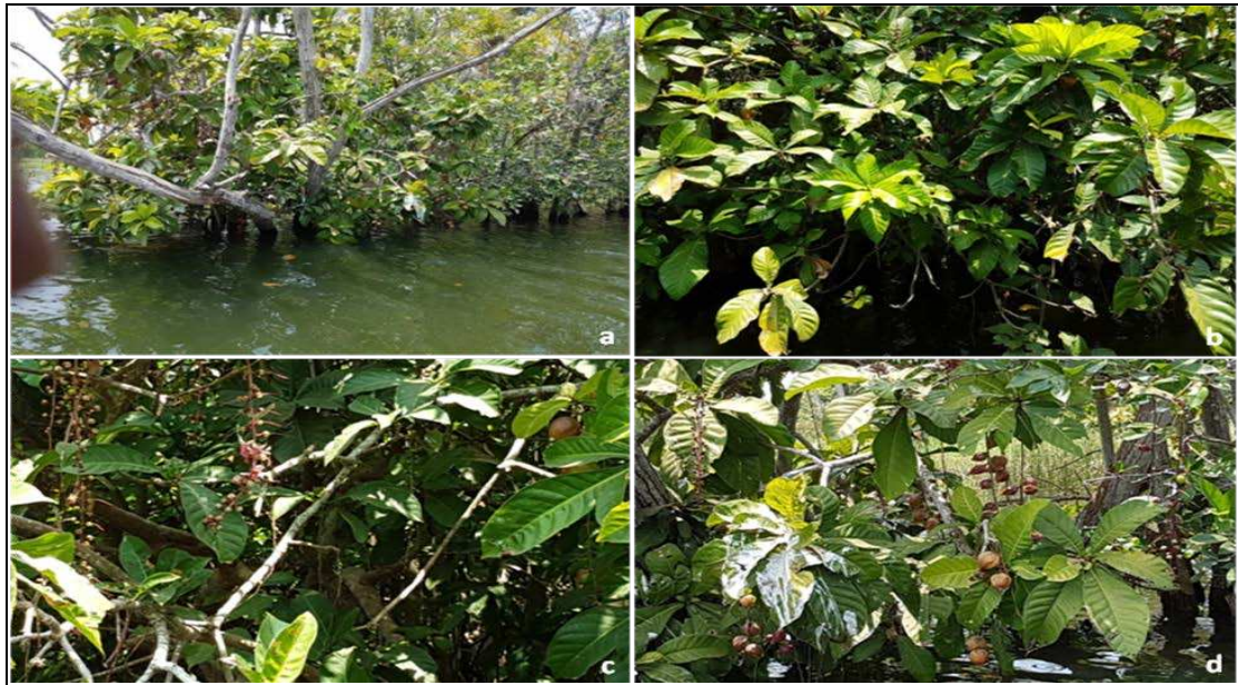
Figure 1: Barringtonia racemosa ; a. Habitat; b. Foliage, c; Flowering phase; d. Fruiting phase.

petals but basally attached to the staminal tube. The stamens are numerous, long, white to pinkish and arranged in five-six whorls of which the innermost whorl is without anthers and all other whorls are with basifixed fertile anthers; they collectively form a large central mass extending into up to 40 mm diameter. The ovary is globular, two-four loculed and each locule contains one-two ovules. The style is simple, filiform, 20-50 mm long and tipped with obtuse stigma. A part of the style and the obtuse stigma extends beyond the height of stamens of all whorls from bud stage and during the entire life of the flower.