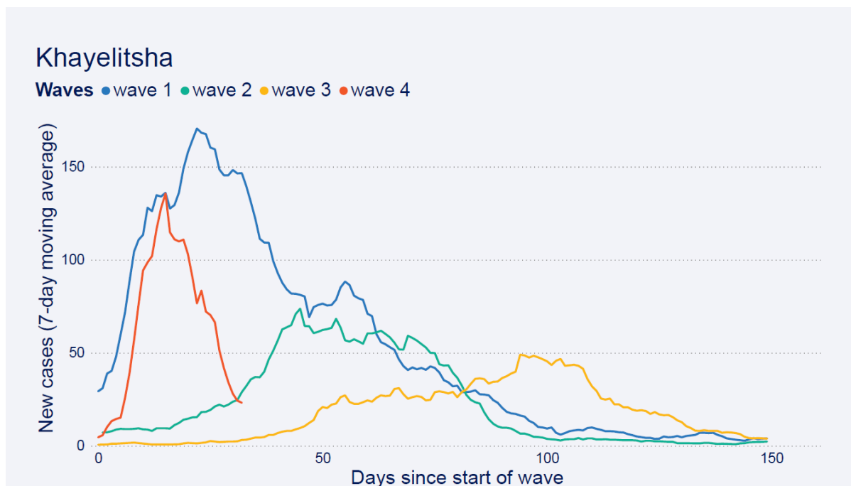
Figure 1: Daily new cases (7 day moving average) by days since start of each wave in Khayelitsha sub-district, Cape Town, South Africa.