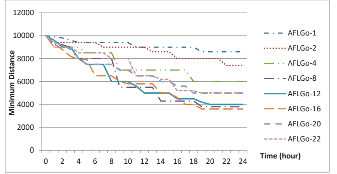
Fig. 4. Comparison on different splittings of the exploration phase and the exploitation phase.

The efficacy of DGF is determined by how the resources for exploration and exploitation are divided. To elucidate this