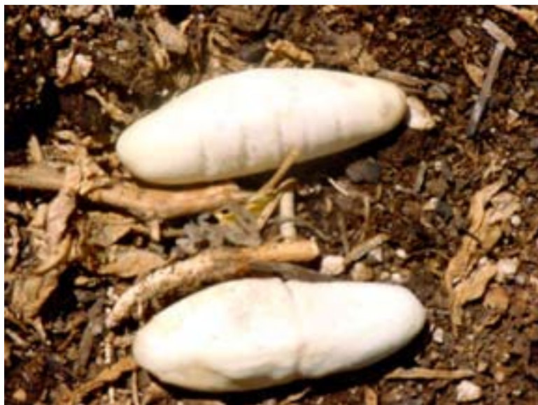
Figure 2. Clutch of V. caerulivirens