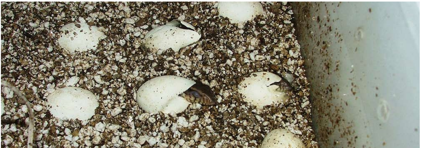
Figure 4. Clutch beginning to hatch

The initial clutch began to hatch after 158 days on 6 September 2004, and by the next day, all 28 eggs had successfully hatched, revealing visibly healthy hatchlings. The two subsequent clutches hatched after 156 and 160 days, respectively. Despite containing all viable eggs, only 18 eggs from the third clutch successfully hatched, with the remaining two embryos dying full-term and fully developed.