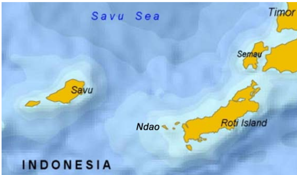
Figure 1. Map of Roti and adjacent islands

Varanus auffenbergi ranging in size from ca. 25 to 40 cm in total length were observed in the villages of Nemberala, located on the southwestern coast, and Boha, the southernmost village on Roti. All searches were limited to within 1 km of the coastline. Varanus auffenbergi were relatively easy to find during the early morning hours before sunrise, sheltered beneath fallen palm fronds and limestone rocks, including those used in fences surrounding villagers’ homes. Varanus auffenbergi were primarily encountered in Lontar Palm ( Borassus flabellifer ) plantations, and searches in other habitats including forested areas revealed no monitors. V. auffenbergi were occasionally seen basking and climbing on the trunks of palms, as well as moving amongst their crowns between 1000 and 1230 h. Plantation workers were able to capture several monitors from the crowns of palms, and many villagers informed me that these monitors are commonly found in the crowns of palms. Lontar palms in the plantations measured ca. 8 to 10 m in height, with each trunk spaced out by ca. 15 m. In many places, the fronds from neighboring palms overlapped, allowing the monitors to move between palms. Little vegetation occurred beneath or between the palms. Varanus auffenbergi were extremely skittish, and fled upon their discovery. Therefore, it was rare to encounter them basking, when compared to the number of individuals which were found beneath rocks and palm fronds.