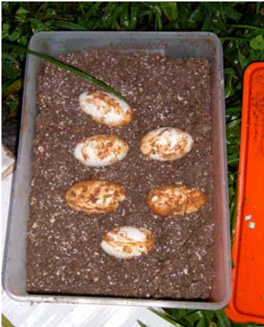
Figure 6. First clutch