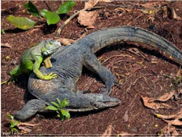
Figure 5. Iguana mounts V. salvator