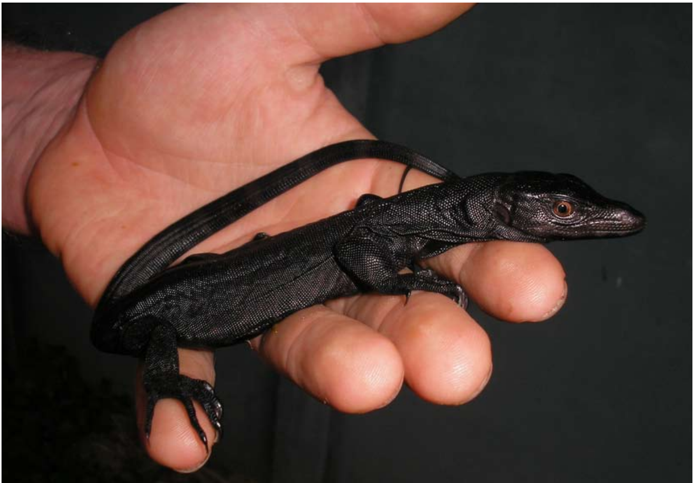
Figure 9. Hatchling in hand