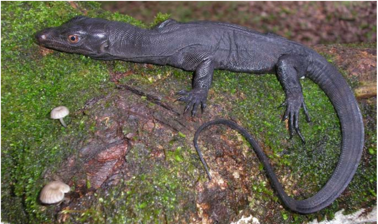
Figure 10. Hatchling in tree