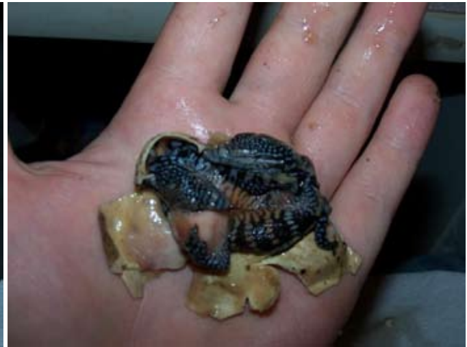
Figure 3. Packaging of twin embryos inside the egg

dizygotic. Judging from the physical condition of each individual, the first three embryos had likely died shortly before dissection of the eggs, based on the lack of decomposition, and fluidity within each egg. The twin embryos had clearly died several days before dissection of the egg, as the skin of both individuals had begun to deteriorate, and the contents of the egg smelled foully. The inner membrane of the egg was desiccated, and the dorsum of each twin was fused to the interior of the egg shell. The cause of deaths is unknown, although incubation difficulties resulting in late-term deaths were also experienced in both previous and subsequent clutches laid by the same female V. macraei , suggesting flaws in the incubation technique.