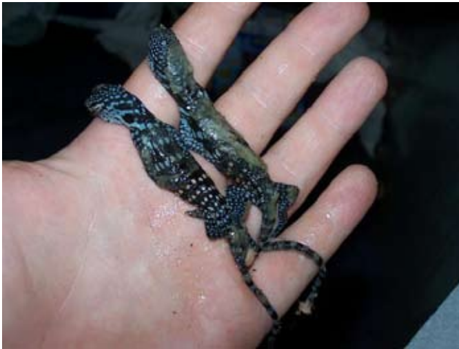
Figure 2. Twin embryos.