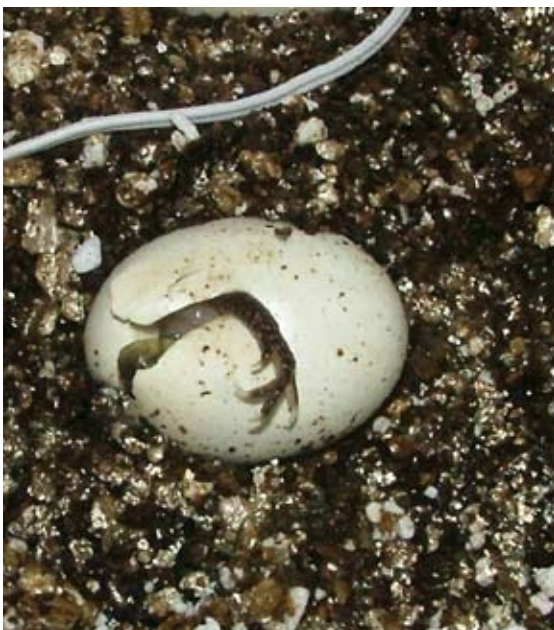
Figure 5. Hatchling emerging from egg