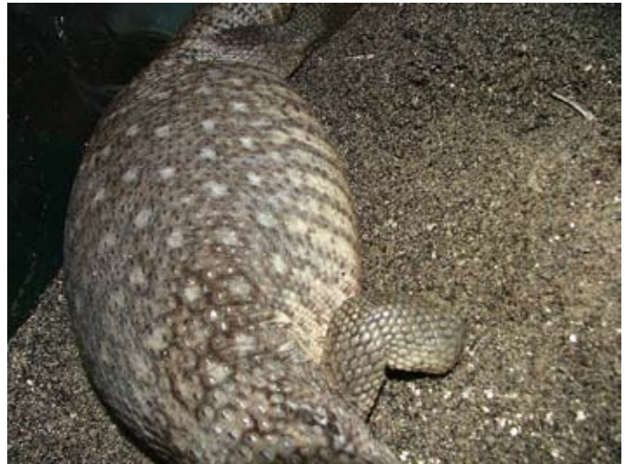
Figure 2. Gravid Female

copulations ceased, the female became very aggressive towards the male, who was therefore removed and placed in a separate enclosure. Ambient temperatures and photoperiod were returned to their original settings, and all misting was ceased. Whole prey items were offered to the female twice daily for the next 4 weeks. Hard boiled eggs were offered every other day with calcium-fortified insects. By sixteen days after the last observed copulation, the female's lower abdomen had become increasingly distended. Physical activity in the female decreased, with all activity restricted to a single corner of the enclosure which would eventually become the site of oviposition. Feeding behavior in the female ceased four days prior to egg deposition.