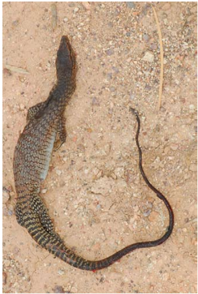
Figure 3. V. tristis retrieved from the same V. giganteus