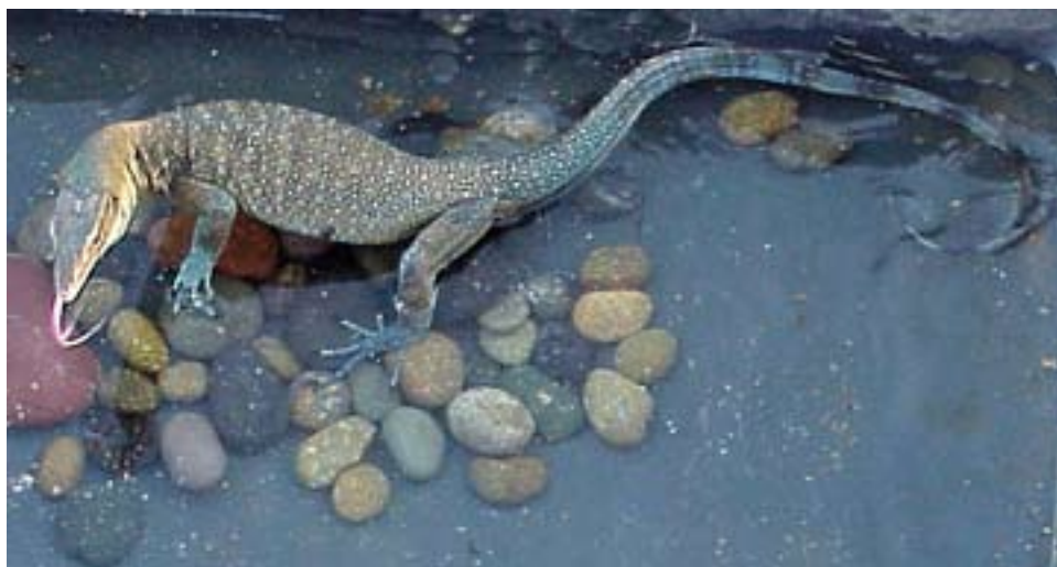
Figure 1. Female Varanus caerulivirens