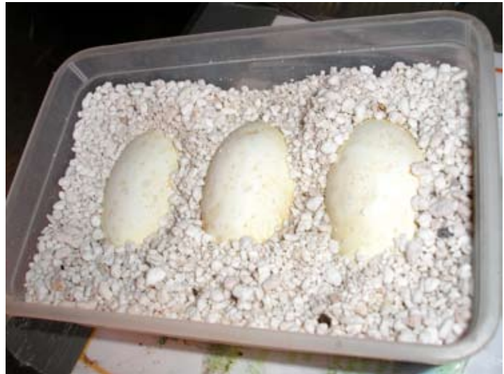
Figure 7. Second clutch

approximately 0500 h the following morning, she resumed digging, and later that morning she deposited six eggs in the burrow and covered them with three dense clumps of grass before re-filling the hole with loose dirt. The depth of the burrow was ca. 30 cm. The eggs were retrieved and placed in an artificial incubator, using peat moss as a medium. Incubation temperatures were maintained at ca. 29 °C. Although the eggs appeared fertile, eventually, the clutch failed to hatch. We suspect that the high clay content of the soil suffocated the eggs, or, that the monitors were not sufficiently acclimated to captivity to produce viable eggs.