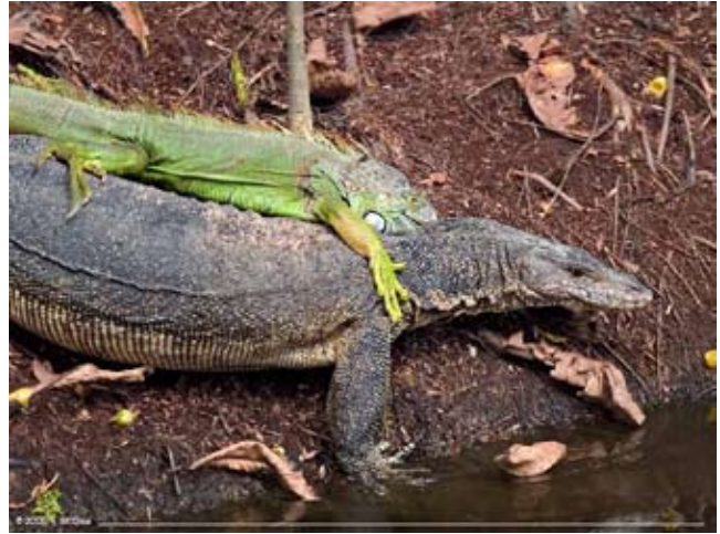
Figure 6. Iguana biting the neck of the V. salvator

the two V. salvator were basking (Figures 2 & 3). Shortly after the iguana's arrival, one of the two basking V. salvator left the mound and retreated to nearby vegetation. Over the next 10 to 15 min, very little movement or activity by the lizards was observed. The iguana's dewlap was fully extended during this time (Figure 4).