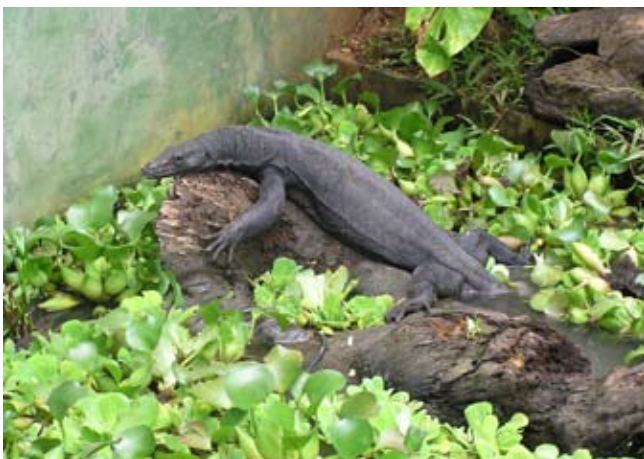
Figure 2. Male basking

In June 2005, an adult pair of Black Water Monitors was purchased from a reptile dealer in Florida, who had imported them from Malaysia the previous year. The monitors were placed in a large, uncovered, outdoor enclosure with a total area of 46.3 square meters. The area of the enclosure consists of 38.5 square