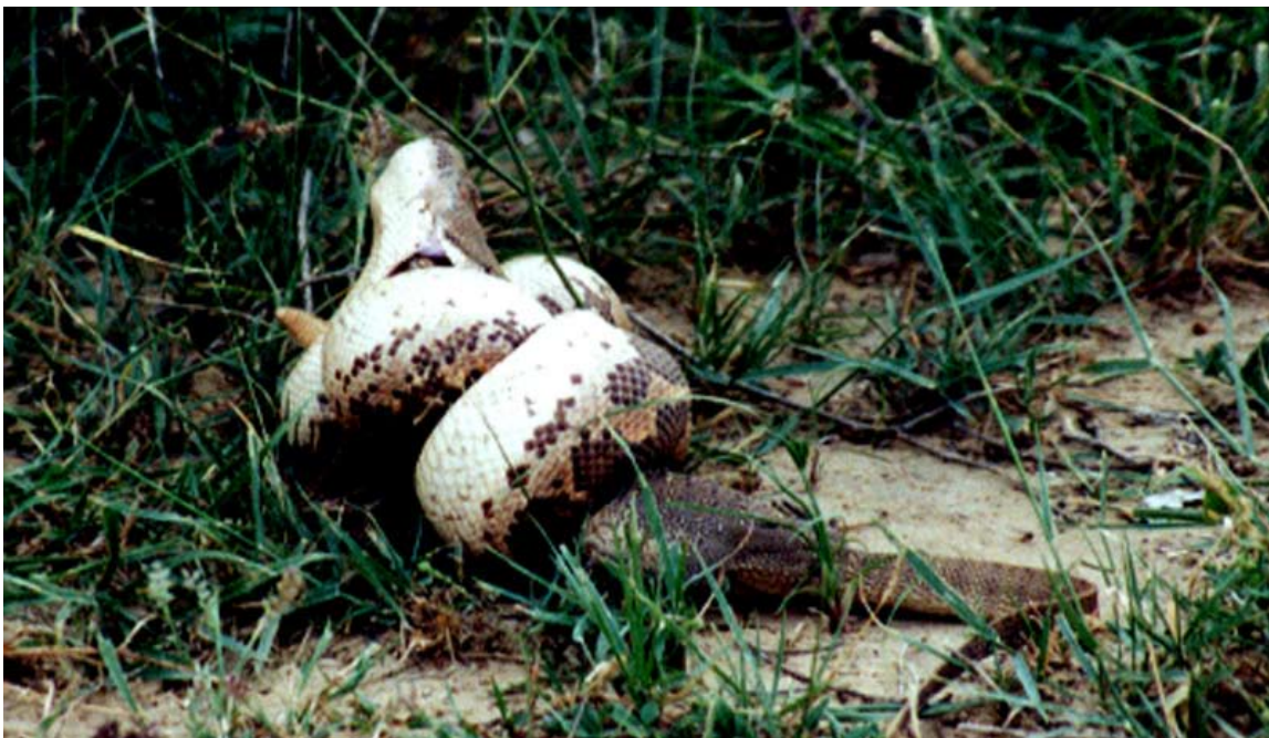
Figure 1. A Varanus bengalensis is preyed upon by a Sand Boa ( Eryx conicus )

Mash, P. 1945. Indian Python ( Python molurus ) preying on Monitor Lizard ( Varanus monitor ). Journal of the Bombay Natural History Society 45(2): 249-250.