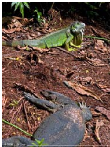
Figure 1. (top left) Male Iguana iguana basking in tree