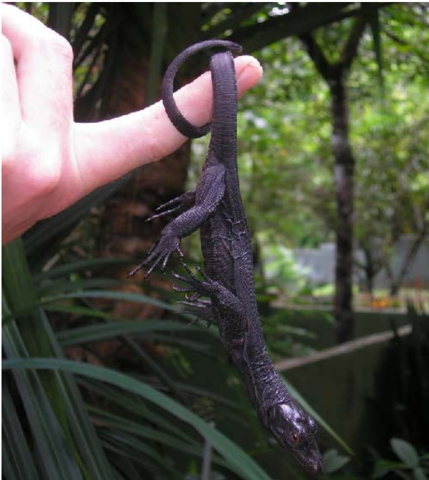
Figure 11. Detail of tail prehensility in hatchling V. salvator komaini