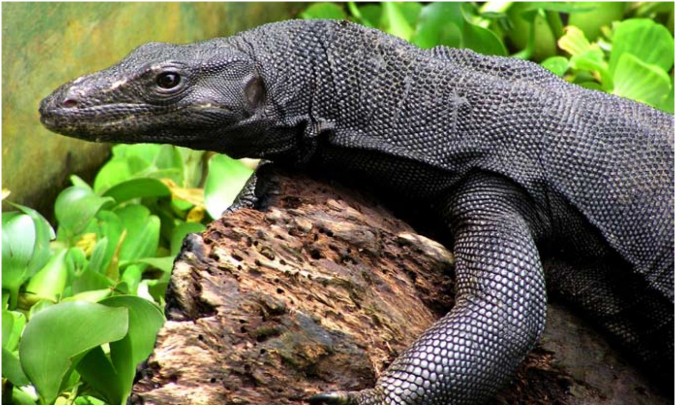
Figure 1. Head detail (male).

The last major revision of V. salvator was that of Mertens (1942). Over the years, the status of certain subspecies of V. salvator has been controversial. Some authorities have argued against the validity of some, or, for the elevation of others to full species status, but the general consensus is that the V. salvator