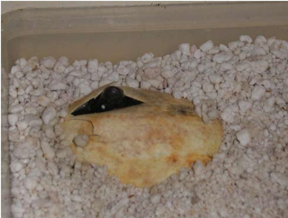
Figure 8. First hatchling Varanus salvator komaini pipping