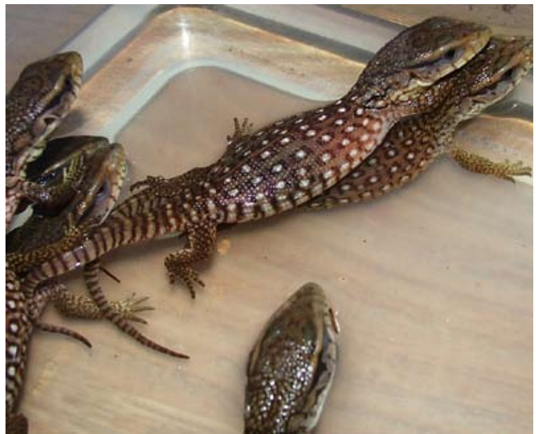
Figure 6. Captive-bred Varanus exanthematicus