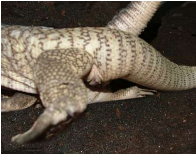
Figure 1. Copulation