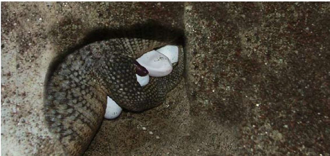
Figure 3. Oviposition

After depositing the eggs, the female covered the clutch with substrate, leaving a small depression above the chamber. Once the female resumed her normal feeding regimen, she gained 450 g in 14 days.