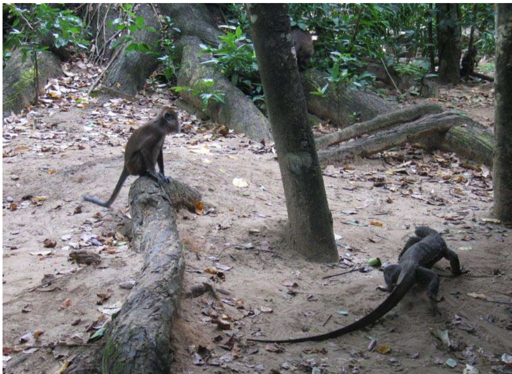
Figure 1. Varanus salvator and macaques congregate in a picnic area