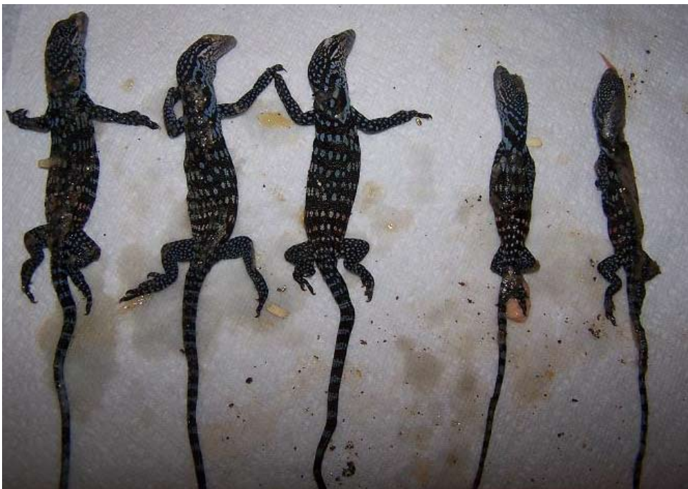
Figure 1. Dead late-term Varanus macraei embryos. Twins on right.

After 211 days of incubation, each of the four eggs began to grow a fungus and were no longer deemed viable. Dissection of the first three eggs revealed dead, late-term embryos, each with varying amounts of residual yolk remaining. The remaining egg contained two dead late-term embryos. Although noticeably smaller than the other late-term embryos (see Table 2), both twins were fully-developed. The twins differed in their dorsal patterning, and the presence of two distinct yolk sacs determined the twinning was