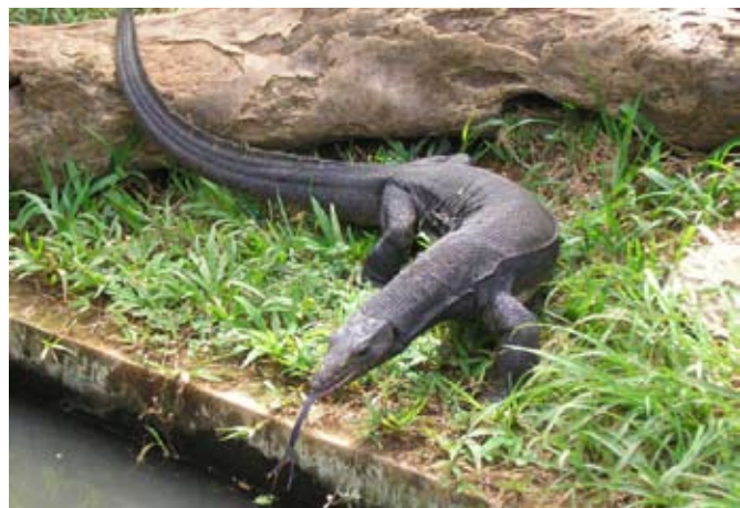
Figure 3. Tongue detail (male)