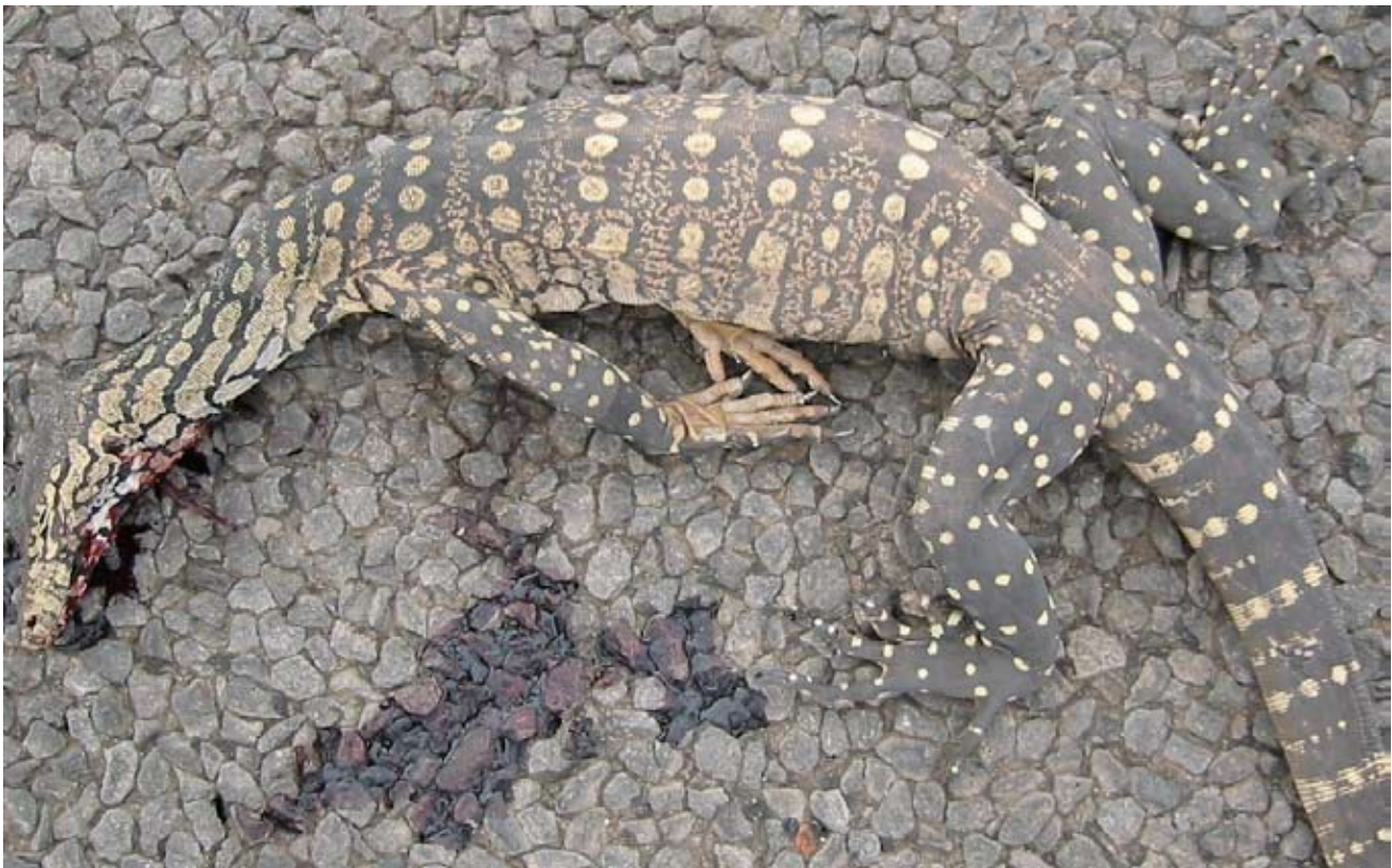
Figure 1. Road-killed Varanus giganteus

Varanus giganteus can attain lengths exceeding 2 m and masses of up to 17 kg (Pianka, 1994). Despite being the largest extant native terrestrial predator in Australia, V. giganteus has received little attention in the literature. Most studies and observations of this species have taken place on Barrow Island off the