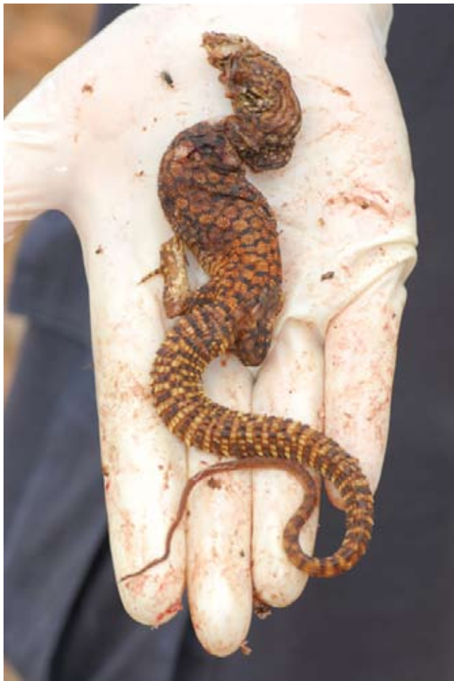
Figure 2. Partially digested V. acanthurus retrieved from the stomach of a V. giganteus