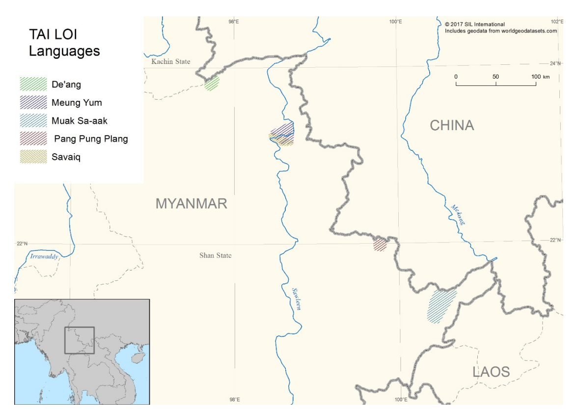
Figure 2: Locations of groups referred to as 'Tai Loi'.