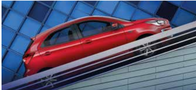
Hill Launch Assist