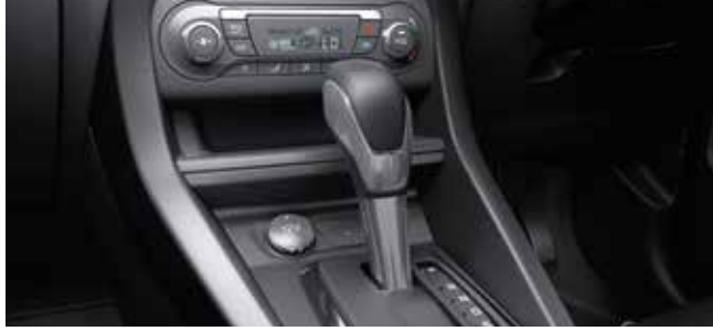
6-Speed Automatic Transmission