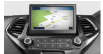
Touchscreen With Embedded Navigation