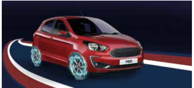
Electric Stability Control