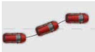
ABS & EBD