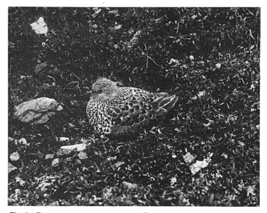
Fig. 3. The male incubated the eggs. The nest was entirely out in the open, on a barren rocky ridge, 1000 feet above timber-line.

At 8 o'clock on the evening of June 24, I climbed to the crest of a sharp ridge of one of the lower spurs of the main Alaskan Range. As I reached the highest peak four Surf-birds flew in from a distance. As they circled about the peak they called tee, tee, teet, loudly. Their flight was swift and plover-like. As they turned, the white basal portions of their tails, together with the white bars of their wings, formed four white V's which stood out vividly in the strong glow of the evening sun. They circled the peak several times, calling loudly and evidently seeking for others of their kind. Soon there was an answering call from the ground and the four birds settled down on a rocky spur where three other Surf-birds were already feeding. When I crawled up to within fifty yards of them all seven birds ceased feeding and began to call loudly. After a period of several minutes they began to feed again, one remaining on guard while the others ran hither and thither chasing insects over the rocks and