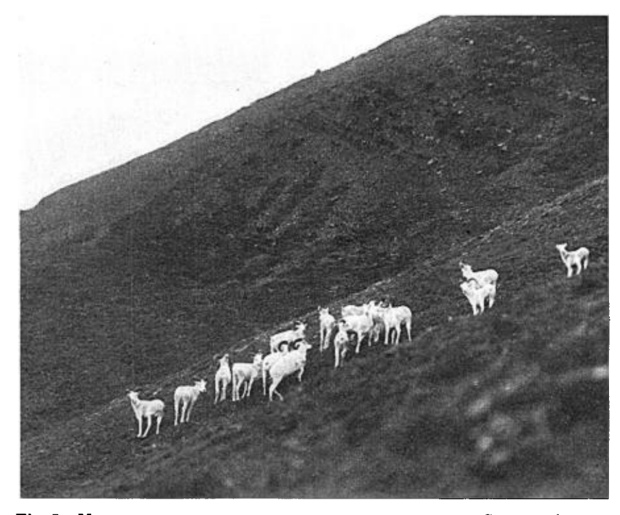
Fig. 5. MOUNTAIN SHEEP GRAZED DAILY OVER AND AROUND THE SURF-BIRD'S NEST.

larger end identifies this egg, which resembles slightly certain eggs of the Yellowbilled Magpie. In egg number two the ground color is rich Tilleul-buff, while the markings consist of bold Bay-colored spots and splashes from \frac{1}{2} to 3 millimeters in length. These spots are concentrated about the larger end of the egg, where in places they are so dense as completely to obscure the ground color. A few deep-seated lavender under-shell markings are apparent on this egg. Egg number three is similar both in ground color and in markings to egg number two, except in egg number three the heavy Bay markings form a decided wreath 21 millimeters in diameter about its larger end. Egg number four has the richest ground color of all, while its markings are Fawn, but the markings are not so sharply defined as in the other eggs.