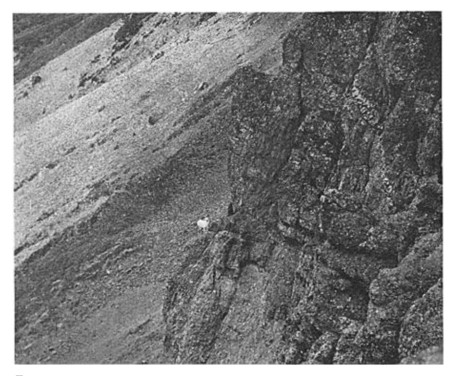
FIG. 2. SURF-BIRDS WERE FOUND MOST FREQUENTLY AT THE FOOT OF SOME RUGGED CLIFF WHERE THE WHITE ALASKA SHEEP DWELL.

This was the Surf-bird situation in 1925 when the writer again became active in the quest. Profiting by his own previous experience as well as that of other naturalists who have worked in Alaska, he came to the conclusion that it was useless to look for eggs of the Surf-bird near the coast or even at low altitude. By a process of elimina-