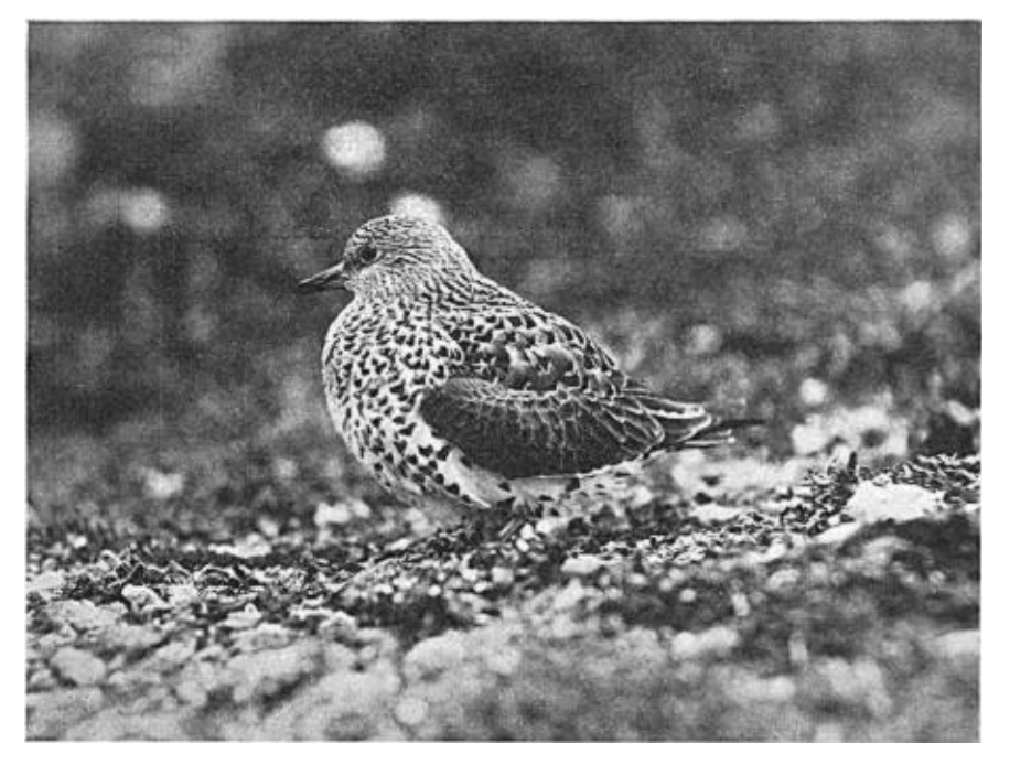
Fig. 7. THE "MATERNAL" MALE SURF-BIRD COMPLAINING BECAUSE HE HAD BEEN DRIVEN OFF HIS NEST.

During subsequent observations, when both sexes were present, as was revealed by our taking specimens, we were unable to find any clew of plumage, size, voice or behavior whereby we could distinguish in the field male Surf-birds from females of the species. However, with specimens in the hand during the breeding season we found that five males collected all had bare incubation patches or egg pockets on their