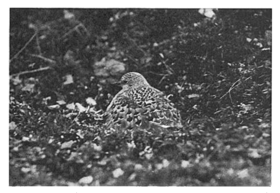
Fig. 6. THE MALE SURF-BIRD ON THE NEST. DURING SNOW STORMS THE BIRD'S FEATHERS WERE SPREAD OUT AS HERE SHOWN, KEEPING THE EGGS WARM AND DRY.

In order to be able to watch the nest continuously we piled up a crude shelter of rocks on the crest of a ridge overlooking the nest and about 80 feet distant from it. This gave us protection from the biting wind, but the rain which began to fall about 10 o'clock soon turned to snow. When it began to rain, the Surf-bird merely fluffed up and then spread out the feathers on his back so as completely to cover the nest (see fig. 6). This proved an effective method, because the melting snow and the rain