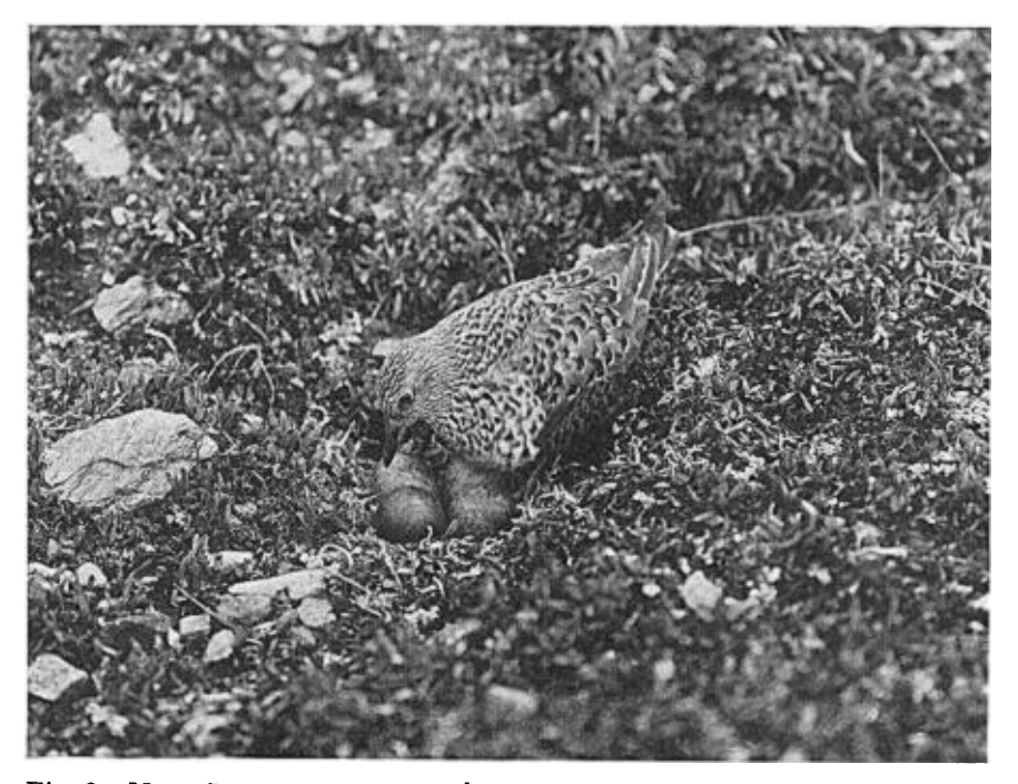
Fig. 8. MALE SURF-BIRD INSPECTING EGGS AND "TURNING" THEM WITH HIS BILL BEFORE SETTLING DOWN ON THE NEST.

One interesting feature, that of the rapid fading of the nuptial plumage of the Surf-bird, has received scant attention. There is now sufficient material in the Museum of Vertebrate Zoology to show clearly when and how the rufous tone of the back is acquired and how and when it is lost. On March 31, 1926, Mr. Chester C. Lamb of the Museum staff collected ten Surf-birds, eight males and two females, at San Felipe near the mouth of the Colorado River, in the Gulf of California. Of these ten birds all but two had acquired, by molt, more or less of the rufous nuptial feathers on the scapulars. Some birds apparently do not acquire this plumage until the last of April, since a female, M. V. Z. no. 9874, collected April 29, 1909, by H. S. Swarth on Kuiu Island, southern Alaska, showed no rufous at all on the back. On the other