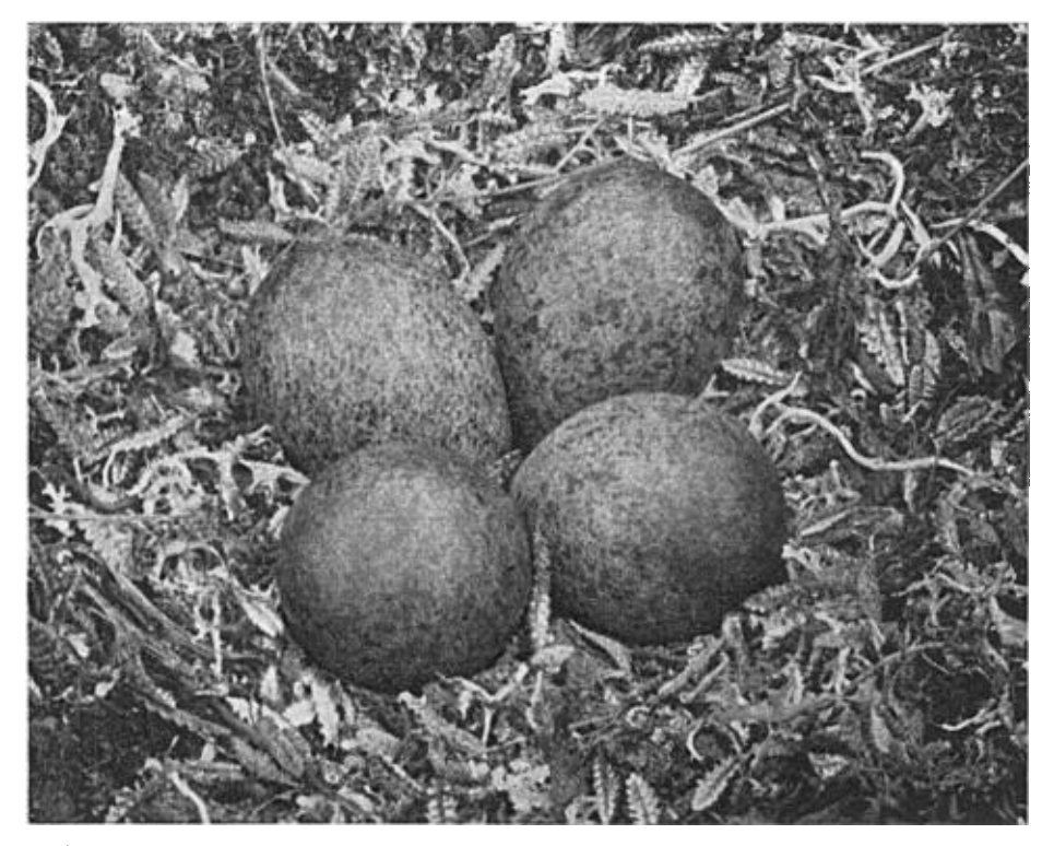
Fig. 4. The nest with its four eggs, here shown natural size, was located in a natural erosional depression.

The eggs of the Surf-bird (see fig. 4) are not easily confused with the eggs of any other North American sandpiper or plover. In shape they are pyriform but, though similar in form to eggs of other birds of the order Limicolae, in color they appear more like eggs of the falcons, particularly certain eggs of the Sparrow Hawk and Prairie Falcon.