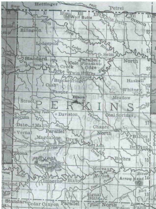
Strool, at center left, is just one of the northwestern South Dakota towns shown here that no longer appear on any map.