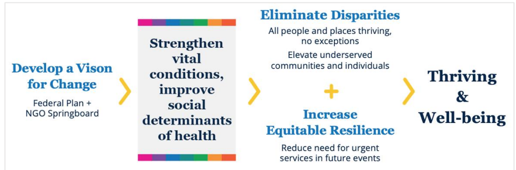
Figure 2: The Interagency Workgroup model for achieving thriving and well-being for all people in all places.

Currently, more than 25 federal agencies actively participate in the Interagency Workgroup developing the LTRR plan. The plan purpose is to align federal actions , outline strategies to improve vital conditions , support community and individual recovery from the impacts of COVID-19, and positively impact health and well-being over the next ten years and beyond. The strategies aim to identify interdependencies, increase coordination, and remove barriers to foster long-term contributions toward community resilience. The initial recommendations identify specific federal actions that can inform the strategies.