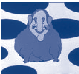
Fig. 14. Jeremy in the Sea of Holes. Yellow Submarine , United Artists, 1968.