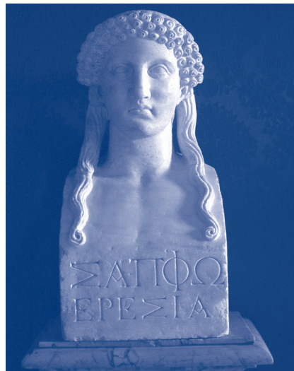
Fig. 1. Sappho Eresia. Marble. Roman copy of a Greek original of the fifth century B.C. Capitoline Museum, Rome.

Poem” appearing in the June 24, 2005, edition of the Times Literary Supplement (available on-line at http://tls.timesonline.co.uk/article/0,,25337-1886659,00.html ), British papyrologist Martin L. West provided details of the discovery