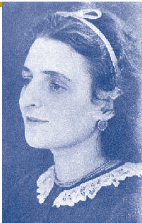
Fig. 11. Laura Riding