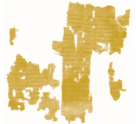
Fig. 2. The "New Sappho Papyrus" (P. Koln. Inv. 21351 and 21376), which can be viewed at http://www.uni-koeln.de/phil-fak/ifa/PK21351+21376r.JPG .

One of the very problems raised by the "New Sappho" has to do with its ending. The ninth line of the poem from the combined Cologne papyri, which contains the names of both Tithonus and Eos, overlaps with line 19 of fragment 58, where only the last two words, "rosy-armed Eos" ( βροδόπαχυν Αἴων ),