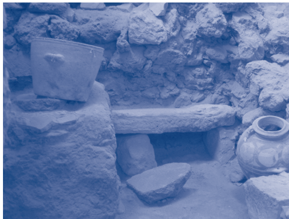
Fig. 9. Akrotiri, Santorini (Thera). Room with a grain mill.

to attribute the destruction on Crete to this much earlier event. For Marinatos' theory to be viable, some way would have to be found to explain how the pottery on Santorini and eastern Crete came from two different eras and yet the volcano caused destruction in both places.