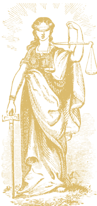
Fig. 10. “Justice.” From Albert Ellery Berg, The Universal Self-Instructor (1883).

But could the blindfold also represent the wisdom associated with justice? This idea could be traced back to Themis, who is associated with prophecy, or to blind prophets such as Teiresias, whose blindness might be associated with deeper insight into the human condition. In Sophocles’ Antigone , the blind Teiresias warns Creon that his law is unjust, and towards the end of the play, the leader of the chorus taunts Creon with the words, “now you see, too late, what justice is” (1270).