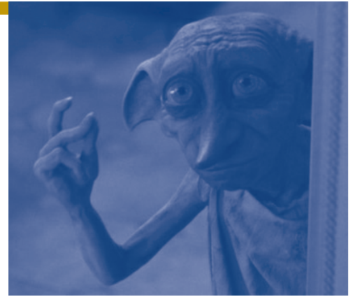
Fig. 6. Dobby the house-elf (voiced by Toby Jones). Harry Potter and the Chamber of Secrets , Warner Bros. Pictures, 2002.