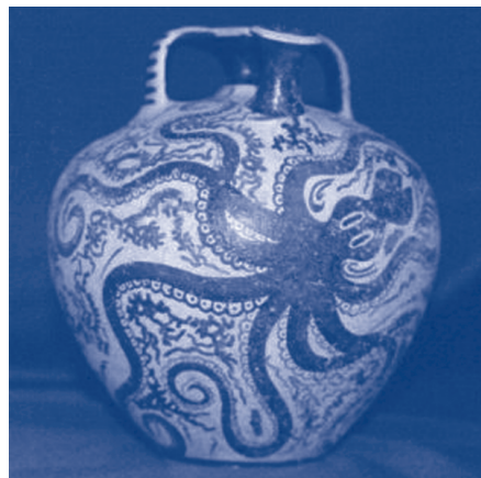
Fig. 8. Replica of the Minoan Octopus Stirrup Jar from the Heraklion Museum, Crete, ca. 1500 B.C. From the collection of The Museum of Antiquities ( http://www.usask.ca/antiquities/index.html ). Photo © Museum of Antiquities, University of Saskatchewan, Saskatoon, Canada. Used with permission.

In current practice, archaeologists further divide this era into Late Minoan 1A and Late Minoan 1B and regard the pottery of these two periods as largely distinct. The floral style is found in both periods, but the latter era, although "difficult to characterize" according to archaeologist Philip Betancourt, saw a multiplicity of styles that included not only marine-style pottery, but also pottery with abstract and geometric designs