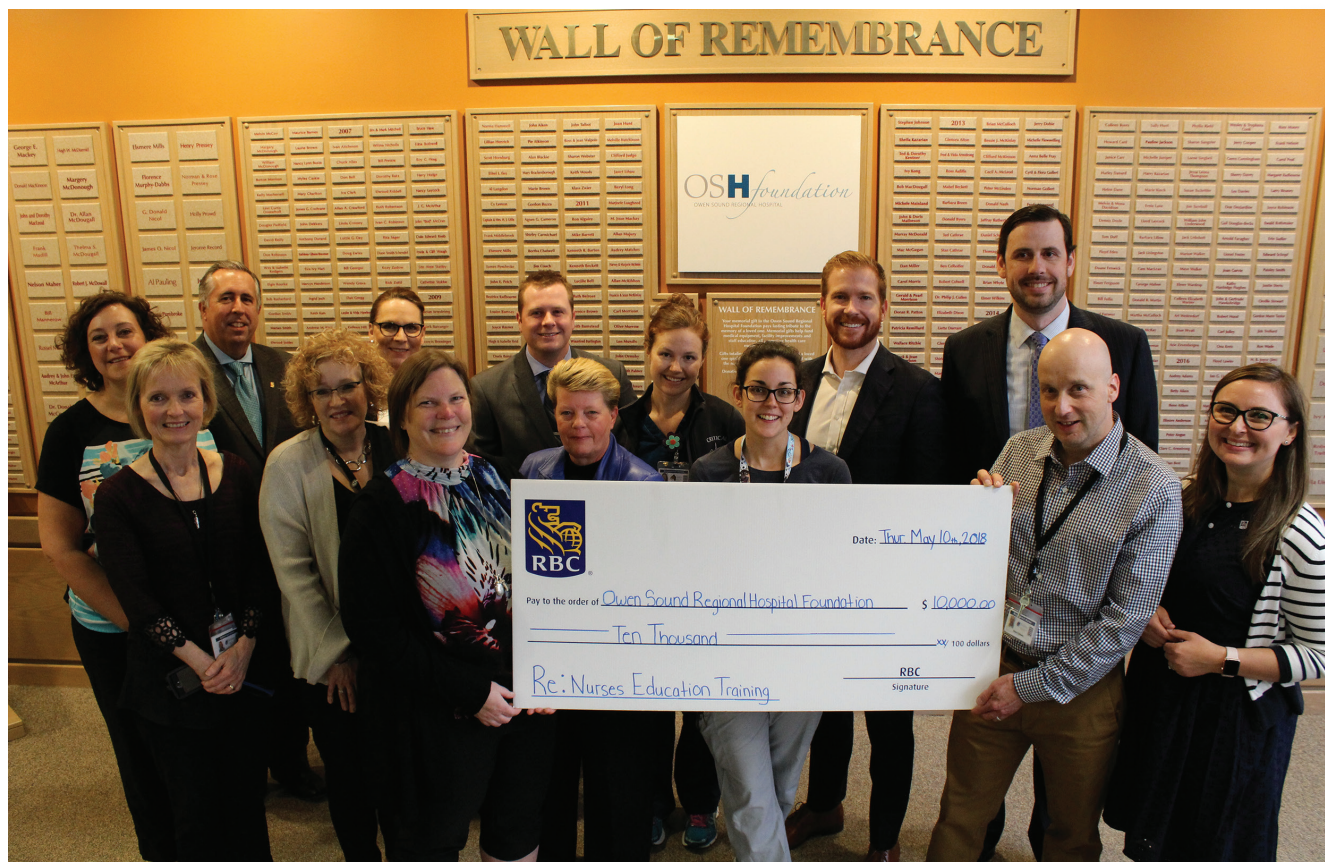
To celebrate Nursing Week, May 7-11, 2018, RBC Royal Bank donated $10,000 in support of continuing education and training for nurses.