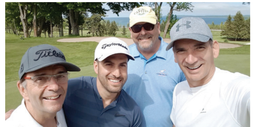
A group of enthusiastic golfers pose for a candid photo at Legacy Ridge Golf Club during the 27th Annual Charity Golf Classic.

Since its inception 27 years ago, the Charity Golf Classic has raised over $1,065,000 to support the purchase of new medical equipment for the Owen Sound Regional Hospital. A huge thank you to everyone involved!