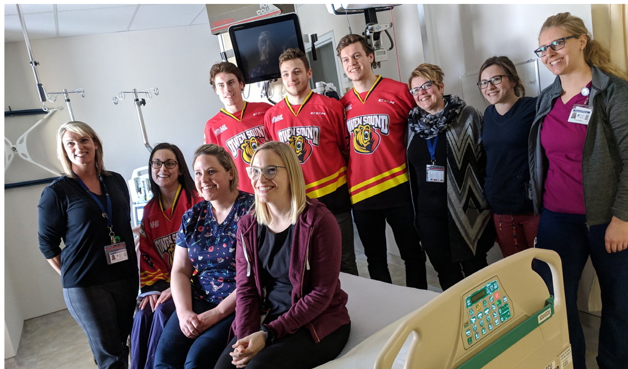
The Owen Sound Attack joined the ICU staff at the Owen Sound Regional Hospital to learn more about specialized care beds. This was part of their Warm Up Jersey Auction, held in March 2019, that raised $7,400 to support the purchase of replacement beds.