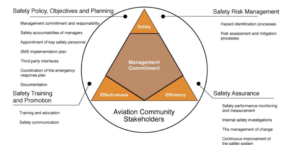
Figure 2: CASA Safety Management System Framework (CASA, 2009)

Operators are provided solid guidance with respect to operationalising the required components on an SMS through the proliferation of support materials in the form of Civil Aviation advisory publications (CAAPs) and other training and promotional materials produced by CASA, including a purpose-built aviation SMS Resource Kit<sup>1</sup>.