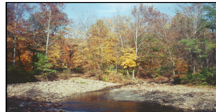
Spruce Run Inlet

Directions from I - 78 Eastbound: Take exit 16 (Washington Exit) to Route 31 north and travel 6.6 miles to Van Syckles Road. Proceed as above.