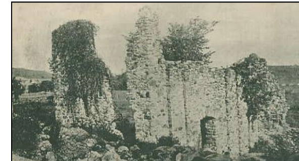
The remains of the old Union Furnace as it appeared in the early 1900s.