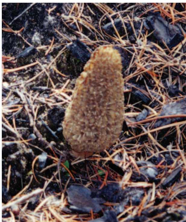
Fig 5 Gray morel growing in the "red needle zone."