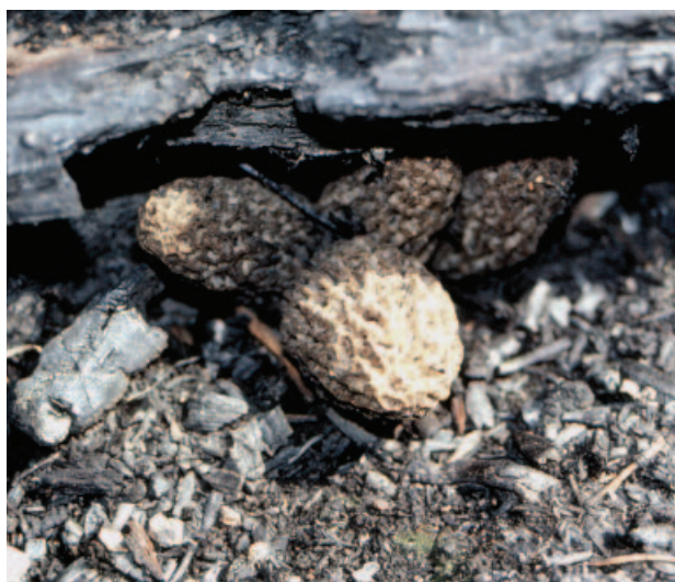
Fig 6 Gray morels growing in the shade of a log.