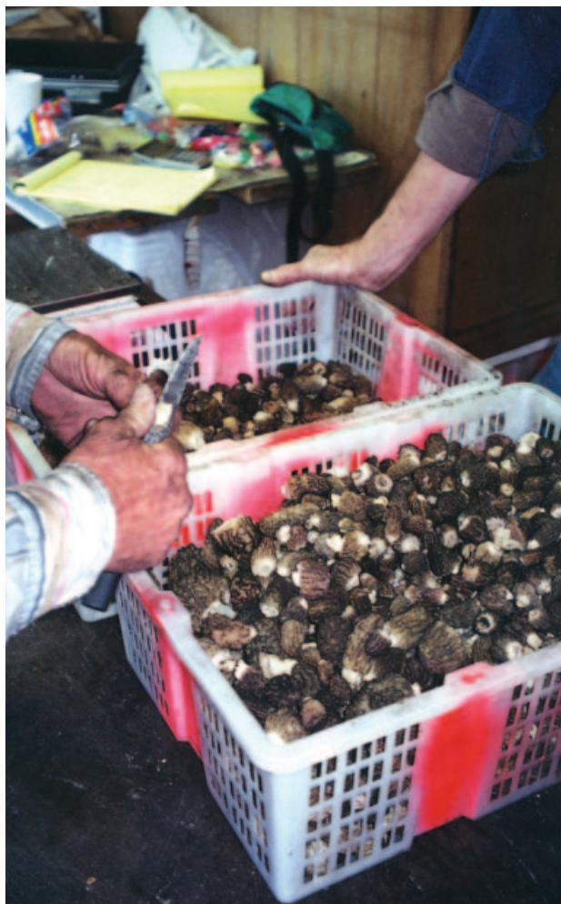
Fig 1 Processing morels at a buying station.