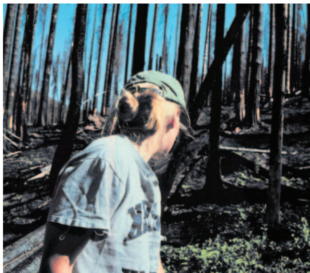
Fig 3 Wildfire-burned forest habitat of gray morels.