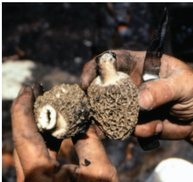
Fig 4 Freshly harvested gray morels with thick flesh.