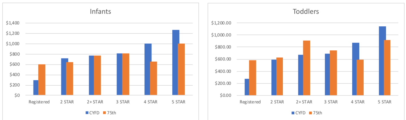
FIGURES 2a and 2b. CYFD Reimbursement Rates Relative to 75 th Percentile Market Rates for Infant and Toddler Care by STAR level

Figures 2a and 2b compare CYFD rates and 75 th percentile market rates for infant and toddler slots by STAR level. CYFD reimbursement rates increase with star level for all age groups. For infants (Figure 2a) CYFD rates are below the 75 th percentile for registered homes, the least regulated type of care, equal to the 75 th percentile rate for 2+ and 3 STAR care, and well above the 75 th percentile for high quality 4 and 5 STAR care. A similar pattern is evident for toddler care (Figure 2b).