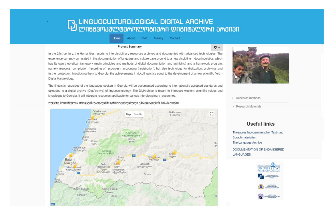
Website of BaLDAR (http://digiarchive.bsu.edu.ge/)

The conceptual approach to the initial BaLDAR is to turn it into a ground-breaking project, giving an opportunity of introduction Western scientific standards in the field, new types of software for the preservation of the heritage, building new databases and developing services for their use.