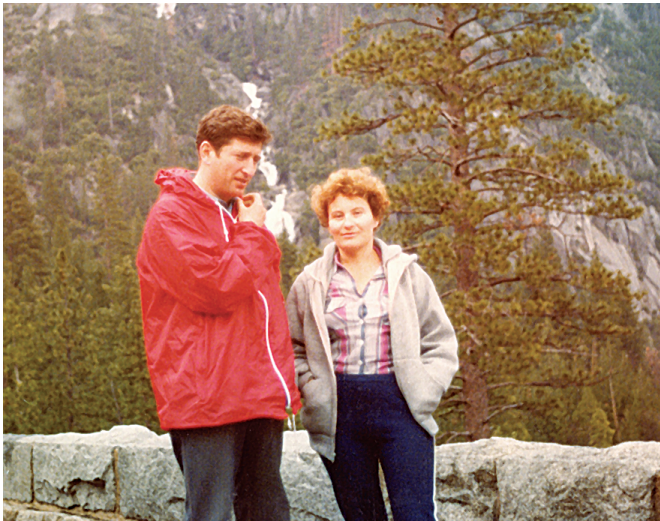
Sinai and Ratner in 1978.