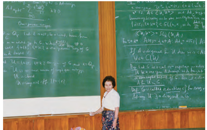
Marina Ratner giving a talk at the International Colloquium at TIFR, 1996.

Ratner landed in Israel, with her daughter, in 1971 and served as a lecturer until 1974 at the Hebrew University of Jerusalem and then at the Pre-academic School of the Hebrew University for another year. During this period Ratner continued her work on the geodesic flows, and also their generalizations in higher dimensions, and established in particular a property manifesting complete randomness of behavior of the trajectories of the Anosov flows, known as the Bernoulli property, that was much sought after in various systems.