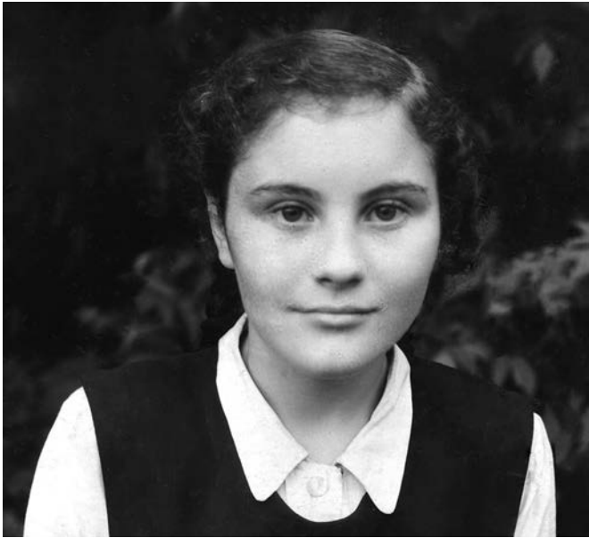
As a girl of twelve, 1950.

Honestly speaking, I initially considered her intention reckless: I knew that she was going alone, with a small daughter, without language and having no relatives there.