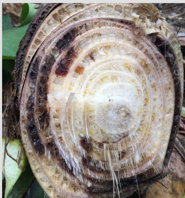
Figure 3. Panama disease affects bananas and is caused by the soil borne fungus Fusarium oxysporum f. sp. cubense

In order to manage the globally developing epidemic, both short and long-term actions need to be taken. In the short term, current exclusion/control methods have to be scrutinized, as the spread of TR4, also within plantations, overwhelmingly demonstrates their inaccuracy and low efficacy. Reliable and standardized tools and protocols for the detection and management of Foc are urgently required, e.g. the use of fungicides and biological crop protection agents / methods. Long(er) term solutions, however, should include: scrutinizing recommended alternatives for the 'Cavendish' clones and, foremost, highly technologically driven and commercially oriented professional breeding programs should eventually diversify the current market with a variety of new banana cultivars that meet consumer preferences and break-up the conservatism of monoculture. Technology, however, has to engage with society and the environment in multidisciplinary approaches for a sustainable future of the banana and its producers.