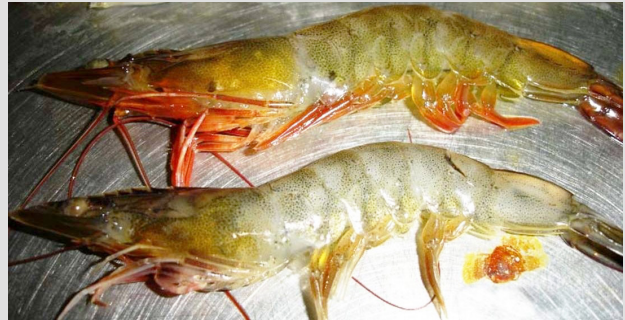
Figure 4: Whiteleg shrimp Penaeus vannamei healthy (upper) and infected with Taura syndrome virus (lower)

Although SPF stock lines are categorised free from specifically listed pathogens (e.g., those of importance in international legislation), the same lines cannot be considered as either 'pathogen free' or indeed, any more able to resist infection and disease associated with emergent diseases. In fact, examples of devastating new diseases continue to occur in otherwise SPF stocks, arising from relatively limited germ-lines, which have been farmed