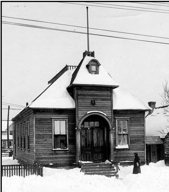
Ss Vladimir and Olga Ukrainian Heritage School on Stella Avenue (UCEC)