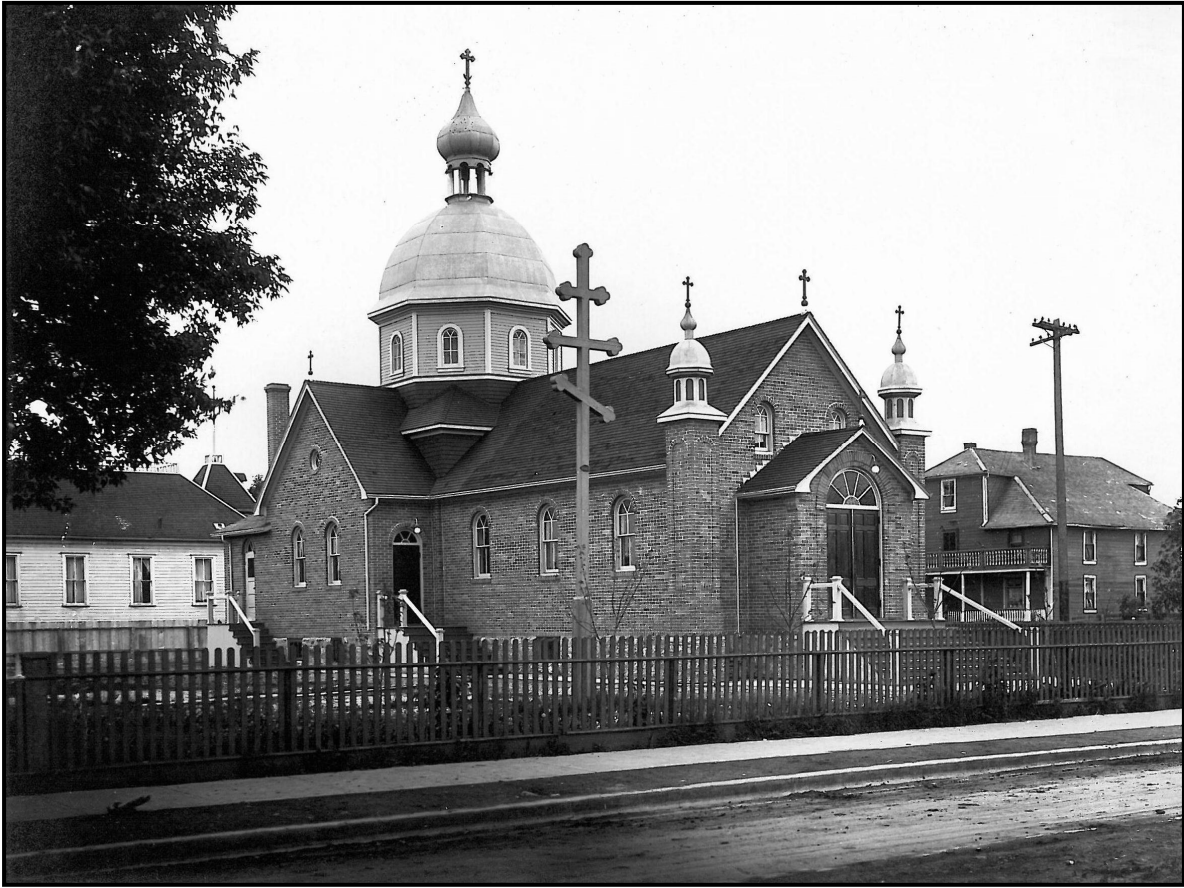
Ss Vladimir and Olga Ukrainian Catholic Cathedral after 1926 renovations (UCEC)