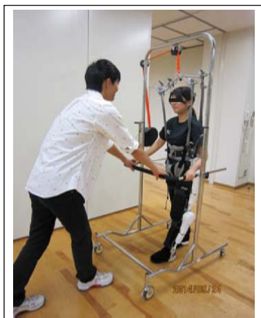
Figure 5: Gait training on the floor with BWSW. BWSW: body-weight supported walker.

Walking speed was adjusted by a therapist to pull the BWSW but not exceed a heart rate of 125 bpm. The initial walking distance during training was less than 200 meters, but it was gradually increased to approximately 500 meters (Figure 6). After gait training and some rest, 5STS was performed. Three therapists helped the subject stand up on a platform, which was 50 cm above the floor. One therapist was in front to manually support him stand up, and the other two assisted from the sides to pull up the harness. His heart rate frequently reached 125 bpm during the last 5STS trial. When his heart rate reached 125 bpm before the last trial, we stopped the exercise immediately. Clinical assessments were performed at the initial evaluation and 3 years after HAL gait training (Table 2).