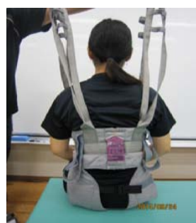
A: The harness for gait training