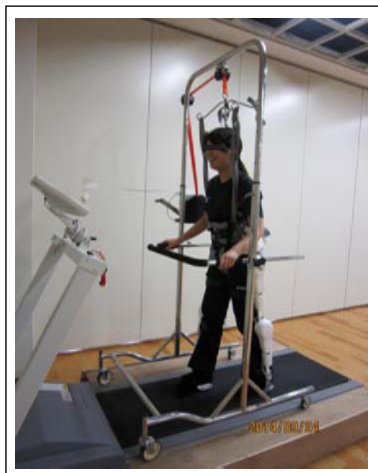
Figure 4: Treadmill training with BWSW. BWSW: body-weight supported walker.