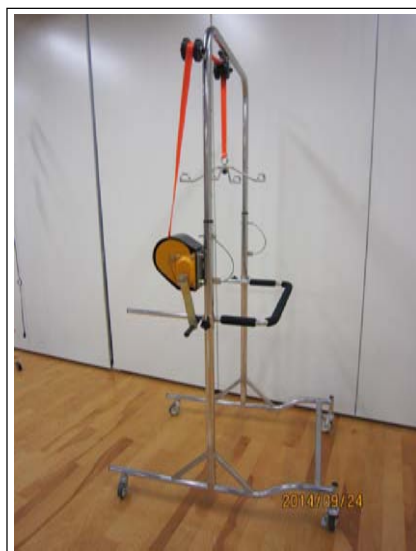
Figure 2: Body-weight supported walker.