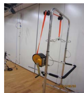
B: Handle for the adjustment of patient height