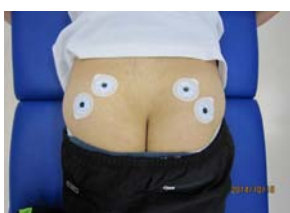
Figure 1: Locations of electrodes for hip extension.

In this phase, the subject under went 2 h of HAL gait training once a week for 1 year (Figure 4). The treadmill speed was adjusted to the patient's condition. The subject could not continue walking with HAL so much after his heart rate reached at 125 bpm. For the safety reason, 125 bpm was set as the discontinuance criteria for the HAL gait training. The treadmill speed and walking distance during the